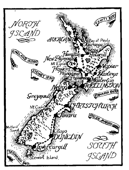
The 3 main islands of New Zealand, roughly the area of England, but 1,000 miles long. The route (about 2,700 miles) shows the principal calls of Ken Stanley. (Also, of course, of previous tourists and the Rowe Twins this summer)

No. 839 (Lett) Three typical New Zealand scenes (Top) Acacia Bay, Lake Taupo Auckland. (Centre) Aerial View of Waverley, Taranaki, near Wanganui, one of the small centres. (Bottom) Mounts Tasman and Cook seen from Lake Mathieson, South Island (opposite coast to Timaru)