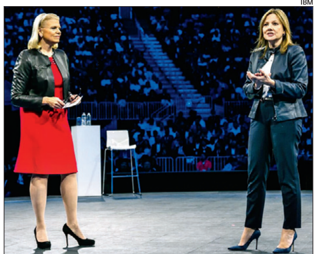
IBM CEO Ginni Rometty (left) with GM CEO Mary Barra at the IBM World of Watson conference in Las Vegas

The game the cute little robot was playing — Rock, Paper, Scissors — has been played by children for generations. But when this seemingly simple game is played hundreds of times, it throws up a wealth of data that can be crunched to come up with complex strategies. Marvin has played it over 600 times, with human rivals already, and every time he plays, he learns. "You won't beat me again," he tells one of the humans who is walking away triumphantly. It's meant as a joke, but one suspects that there may be an element of