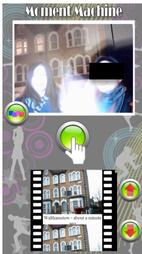
Figure 2 – The Moment Machine’s user interface. The first version of the application allowed posting and viewing photos only on a public display network.

words, little research has looked into privacy considerations of creating user-generated content through networked public displays and viewing it on them, as well as understanding implications of posting user-generated content to other places on the web, e.g., Facebook. The contribution of this paper is twofold: