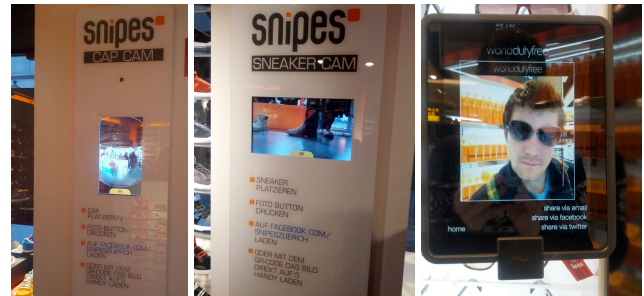
Figure 1 – Example of situated snapshots from the real world. Snipes store: cap cam (left) and shoe cam (second left) capture situated snapshots, which can be found on Snipe's Facebook page [25]. World Duty Free store at Gatwick airport (right) that allows taking situated snapshots and posting to one's Facebook page.

DOI: http://dx.doi.org/10.1145/2757710.2757739