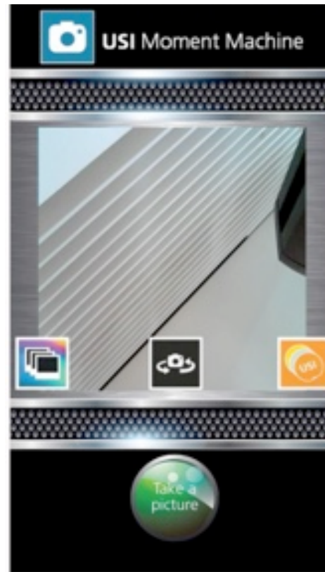
Figure 3 –An example of students flipping the camera up so it would not show them on the live video feed

Connected to the above two challenges is the challenge of supporting on-display content moderation for situated snapshots. This relates not only to deciding where to store the photos (as potentially they could be stored on a user desired location), where to post the photos (on what displays and places on the web), but also how to support controls that allow deletion of photos. In one case for the Moment Machine deployment, a person complained that she could not delete a photo that she was in. She appeared in the photo by accident, i.e., someone else took the photo while she was passing by a display. The participant commented that she is a "perfectionist" and that she does not want to have photos of her where she is not looking good, especially not in a place that she attends/passes-by on a regular basis. Similar cases also happened for the Moment Machine 2.0 deployment where the application