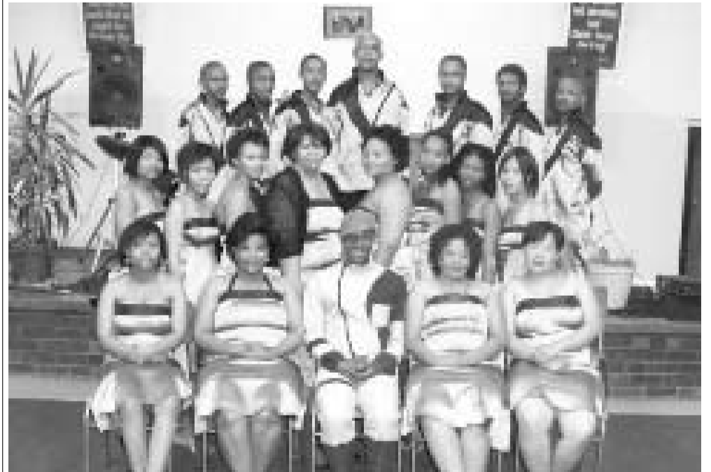
Hier verskyn die Petrusville Gemeenskapskoor wie onlangs hulle eerste CD bekend gestel het.