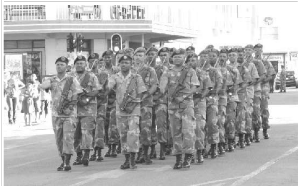
The SANDF vowed to everybody at the Talent Search Competition with a march and a drill display.