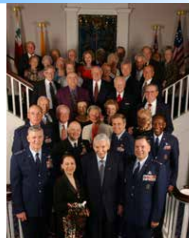
Last Reunion of General Schriever's Missileers