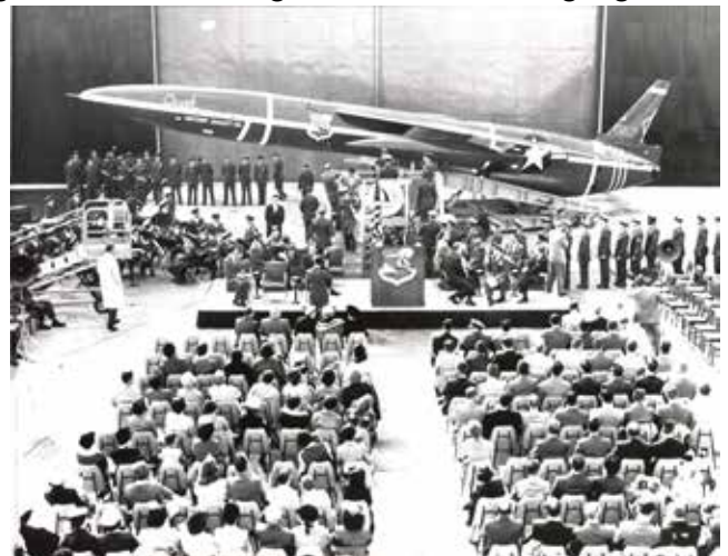
First Snark “Missileairmen” Graduate at Northrop Factory n 1957