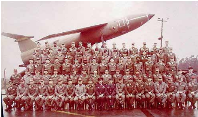
Bitburg Tactical Missileers