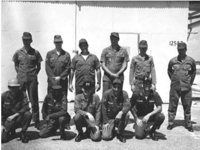
A BOMARC Crew