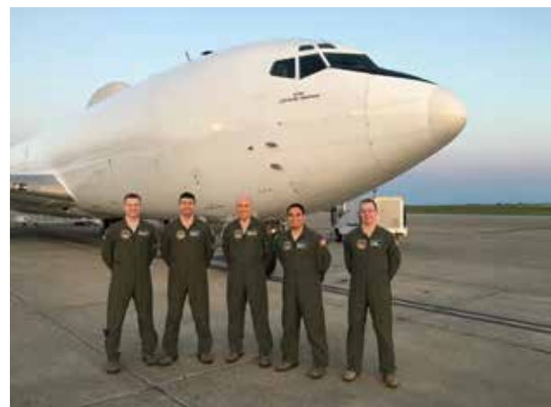
GT217GM ALCS Crew

Today, at least one USSTRATCOM ABNCP is on alert around-the-clock. It is postured with a full USSTRATCOM battlestaff and ALCS crew onboard to perform the Looking