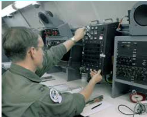
ALCC Crew and New Common ALCS Equipment

to ensure Minuteman was disabled. This theory motivated SAC to design a survivable means to launch Minuteman, even if all the ground-based command and control sites were destroyed.