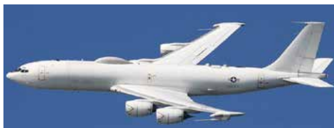
E-6B - Today's Aircraft

The 4 ACCS was the workhorse of ALCS operations. Three dedicated Airborne Launch Control Centers (ALCC) (pronounced "Al-see"), designated ALCC No. 1, ALCC No. 2, and ALCC No. 3 were on ground alert around-the-clock providing ALCS coverage for five of the six Minuteman ICBM Wings. These dedicated ALCCs were mostly EC-135A aircraft but sometimes were EC-135C or EC-135G aircraft, depending on availability. ALCC No. 1 was on ground alert at Ellsworth and during a wartime scenario, its role would have been to take off and orbit between the Minuteman Wings at Ellsworth and F.E. Warren AFB, WY, providing ALCS assistance if needed. ALCCs No. 2 and No. 3 were routinely on forward deployed ground alert at Minot. During a wartime scenario, ALCC No. 3's role would have been to take off and orbit between the Minuteman ICBM Wings at Minot and Grand Forks AFB, ND, providing ALCS assistance if needed. ALCC No. 2's dedicated role was to take off and orbit near the Minuteman ICBM Wing at Malmstrom AFB, MT, providing ALCS assistance if needed. The 4th ACCS also maintained an EC-135C or EC-135G on ground alert at Ellsworth as the West Auxiliary Airborne Command Post (WESTAUXCP) a backup to SAC's Looking Glass Airborne Command Post (ABNCP), as well as a radio relay link between the Looking Glass and ALCCs when airborne. Although equipped with ALCS, the WESTAUXCP did not