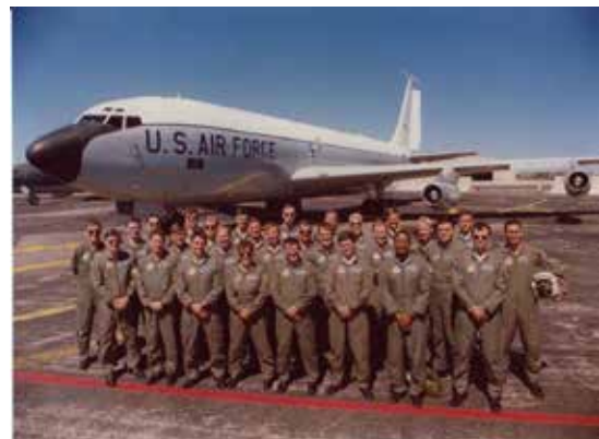
4 ACCS Officers in the 1980s

Faced with only a few Minuteman LCC targets, the Soviets could have concluded that the odds of being successful in a Minuteman LCC decapitation strike were higher with less risk than it would have been having to face the almost insurmountable task of successfully attacking and destroying 1000 Minuteman silos and 100 Minuteman LCCs