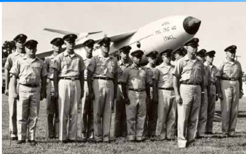
An Early Mace Class Graduation at Orlando