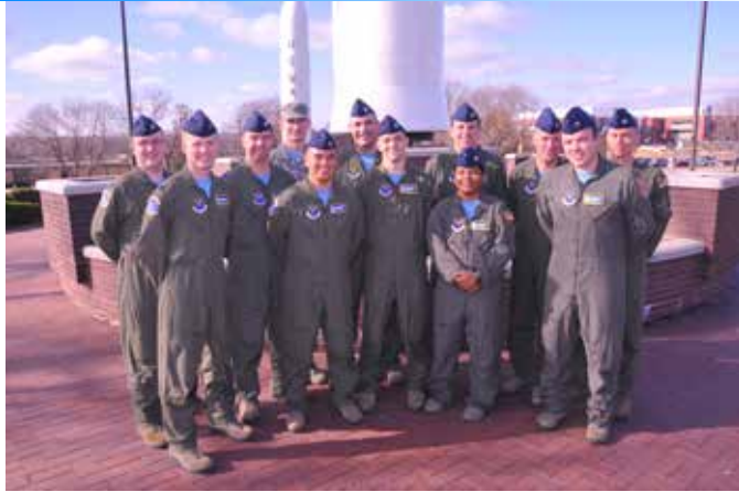
Current ALCS MCCC-As and ALCS Engineer

have a dedicated Minuteman ICBM wing to provide ALCS assistance to.