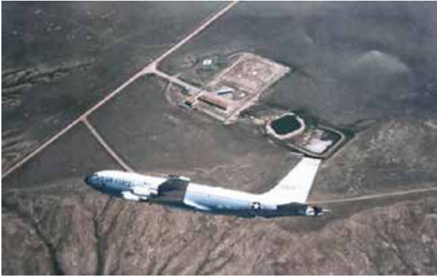
EC-135A Over a Missile Alert Facility