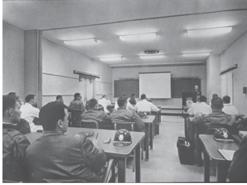
Early Minuteman Pre-Departure

The last operational BOMARC was depostured from alert in 1972, but the 4751 ADS (M) remained active until 30 September 1979 to support BOMARC drone operations over the Eglin Gulf Test Range (which actually began in 1967). Because the “schoolhouse” nature of the unit had ended, its manning was undoubtedly less than it had been during the 1960-1972 period when a full staff of instructors was needed. During that period, about 195 of the 239 military personnel were performing duties directly related to the missile. As for the operational units, the figures below assume one rotation. The post-schoolhouse figures assume a third rotation at the beginning, but without instructors. The 4751 ADS (M), 1959-1972, 390 officers and airmen, then for 1973-1979, 180 Missileers.