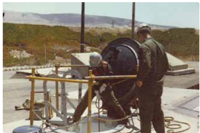
Minuteman Maintenance - “Lower Away”

We had 3 launch sites with 5 crews per site. Each crew had 2 members, a company grade officer with the title Launch Control Officer (LCO), and an NCO with the title Communications Console Operator (CCO). The CCOs were from the communications career field. The LCOs were from various career fields, or were new 2nd Lts, and trained to become Missileers - much like the earliest days of ICBMs - like when I started in Atlas F, where we were