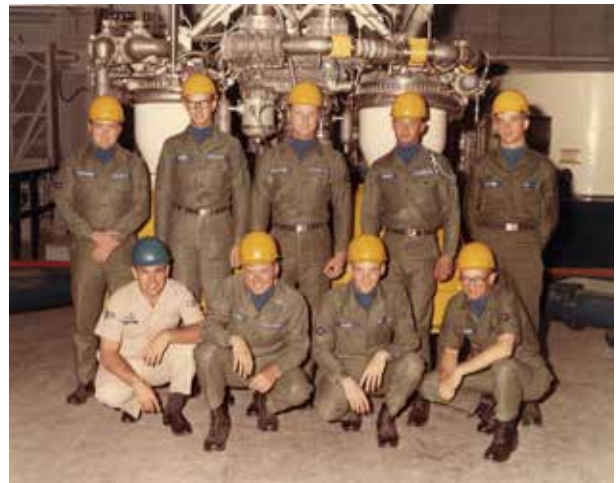
Titan II Maintenance Team

There were also two BOMARC units in Canada, manned by Canadian personnel, and launch was accomplished using a two-key system, and the second key was controlled by US military personnel assigned to the 425 Munitions Maintenance Squadron (MMS), activated 5 March 1964, in detachments at RCAF Station North Bay (446th Surface to Air Missile Squadron (SAMS)) – Detachment (Det) 1, 425 MMS (inactivated in 1972) and RCAF Station La Macaza (447 SAMS) – Det 2, 425 MMS (inactivated in 1972). Because their duties were limited to providing “custodial and maintenance functions for US material in Canada” (i.e., the nuclear warheads for the missiles), it seems unlikely that more than a handful (perhaps a dozen or so) of personnel were assigned to each detachment. Although they were nuclear weapons technicians, because they were also key-turners, they should be considered Missileers even if they never wore the “pocket rocket.” It is estimated that the 425 MMS contribution for RCAF BOMARC (1964-1972) is 50 Missileers.