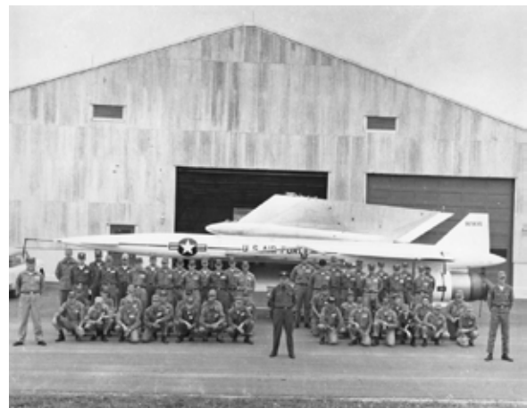
Hound Dog Missileers - 379 AMMS

Since Matador and then Mace were around from 1954 until 1969, there were obviously more Missileers than the ones mentioned above, and while there were as many as 14 different tactical missile units at one time, the number of active squadrons varied somewhat throughout that history. There were also a number of Missileers in units that were involved with Matador and Mace in addition to the squadrons, including the 6555th Guided Missile Wing and Squadron and others involved in other tasks related to missile guidance, testing and training. If we assume that there were about 5,000 Missileers in the units at any one point when all were active, and add the fact that the systems were around for over 13 years, there had to be some Missileers who came and went, and were replaced, during that period. In 1962, when I arrived at Mountain Home AFB, ID, to begin duty in Titan I maintenance, several NCOs that I worked with had come from Matador and Mace. To arrive at our estimate, we assumed that at least half of those 5,000 positions mentioned above were filled by more than one person over the life of the system. Taking into account that the number of units wasn’t constant, that some people stayed for several years, or served in more than one location over the period,