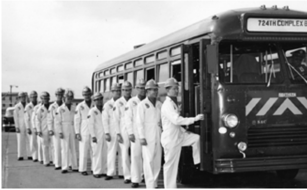
Lowry Titan I Crew Heading to Alert

extensive research on the manning of the eight BOMARC squadrons, the Canadian units, the training organization, the 4751 ADW (M).