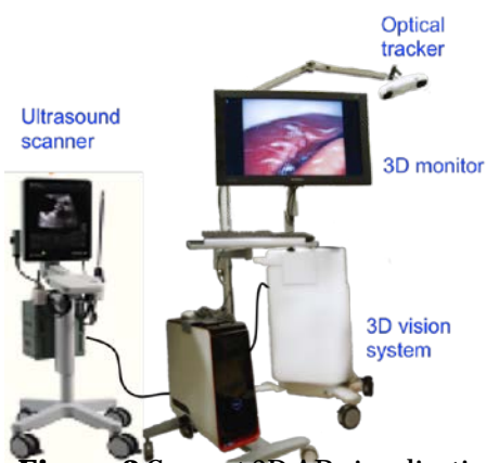
Figure 2 Current 3D AR visualization prototype.

We have a fully operational prototype as shown in Figure 2. This prototype has been tested in phantoms and animals and we have published these results [2, 3]. We have indeed taken care of protecting our IP and have a pending patent [4]. More recently, with IRB approval, we have begun testing the prototype clinically and have imaged the hepatobiliary anatomy successfully in three patients referred for laparoscopic cholecystectomy (see Figure 3). A movie clip showing the resulting AR visualization is available at https://www.youtube.com/watch?v=o2gRihy-wc . This novel mode of visualization clearly shows the bile ducts and, in this particular example, a stone in the cystic duct in the surgical field of focus. It should be appreciated that these internal structures would not be visible during a conventional laparoscopic procedure.