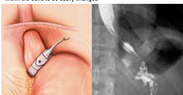
Figure 1. The normal appearance and position of the LAGB. The laparoscopic adjustable gastric band is placed 1 cm below the oeosophago-gastric junction. It is lined by a balloon that is connected via tubing to a subcutaneous port that allows the amount of fluid within the band to be easily changed

over 5000 patients without a death, and a systematic review of all the published literature has confirmed a very low risk of perioperative death (0.05%) or complications (2.6%), one-tenth of the risk of gastric bypass.<sup>12</sup>