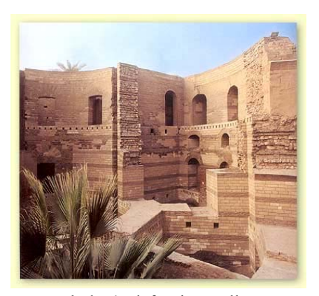
Babylon's defensive walls

In line four we come across geographical information. The Fort of Babylon (Middle Persian B\bar{a}bil\bar{o}n )<sup>14</sup> was established by the Romans and it appears that the Persians were able to occupy it early on during the conquest (618 CE). This is important in that it was to be conquered by the Arab Muslims in 641 CE, just over a decade after the Persian occupation, and the Islamic city of Cairo would get its start as the southernmost area of the city. Babylon was a garrison fort which the Persians occupied after defeating the Byzantine forces there and was important in that it was the in-between center of Upper and Lower Egypt.