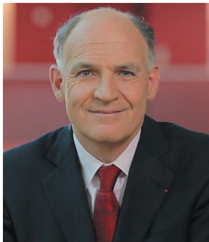
Pierre-André de CHALENDAR