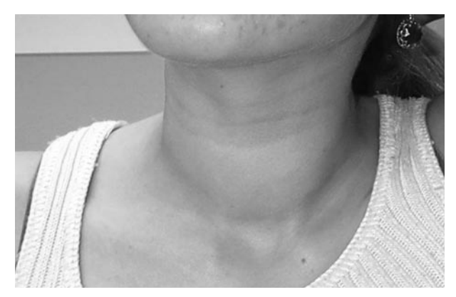
Figure 2. Goiter of Graves' disease.