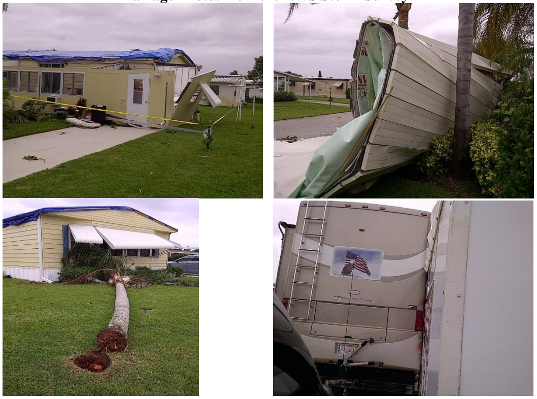
A few damage photos from the Ridgeway Mobile Home Park: