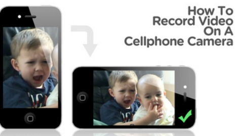
Step 1. Turn your phone sideways Step 2. You're done.

1. The video that you send us can be on a DVD or USB drive. IMPORTANT : Make absolutely sure that the disc is finalized .