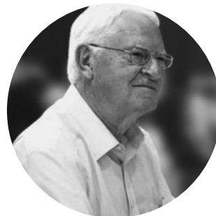
Colin Jenkins Governor, USA