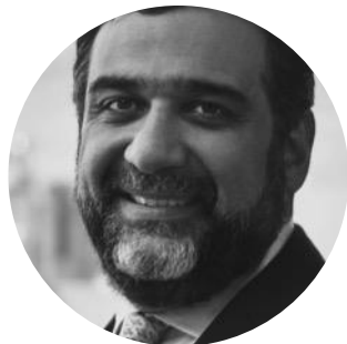
Ruben Vardanyan Governor and Trustee, Chair of the Board of Trustees, Russia