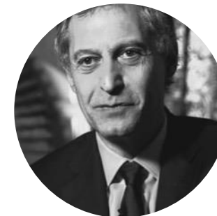
Pierre Gurdjian Governor, Belgium