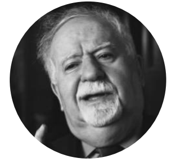
Vartan Gregorian Governor, USA