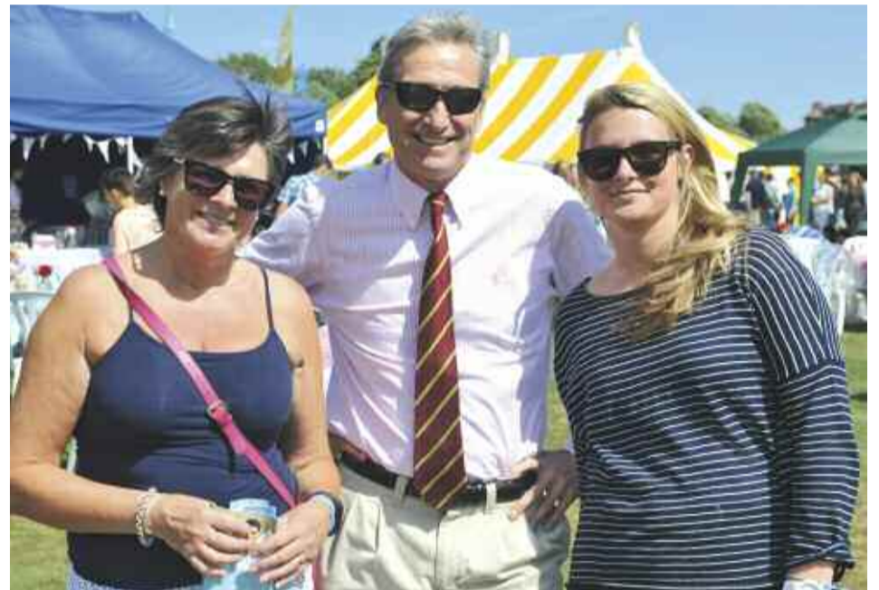
The High Master and his family at the Summer Festival