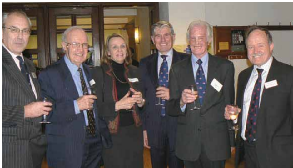
Clearly anticipating a good supper

(This is an edited version of the Chairman's report delivered at the AGM)