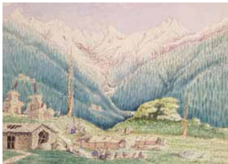
Plate 6 - Raj Man Singh, The source of the Trisuli River , © Royal Geographical Society.