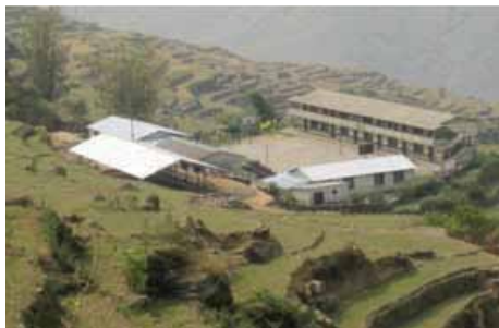
Himalaya Milan Secondary School, Tangting

From abject poverty to magnificent buildings and temples, from spectacular scenery to mountains of rubbish in the roads and rivers of Kathmandu, from an inconsistent power supply to consistent horrendously bad driving, and from a hint of political unrest to the exceptionally tolerant interaction of a multi-cultural society, The hospitality shown to all of us throughout our stay in Tangting was amazing.