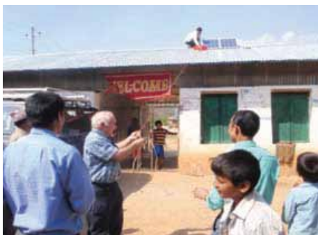
Unveiling the solar power scheme