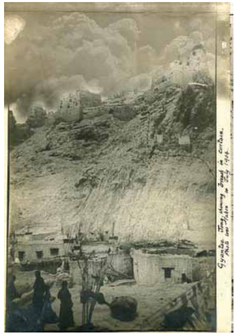
Gyantse 1904 showing the breach in the curtain

For this action seen by so many including the escort commander resulted in the award of the VC to Grant.