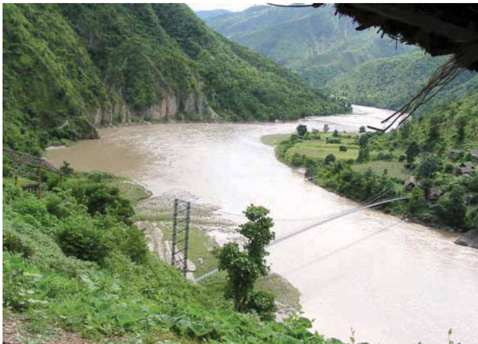
The Bridge over the Arun River at Anterighat