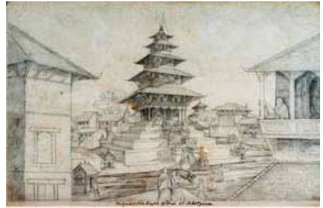
Plate 3 - Raj Man Singh, The Nyatapola Temple, Bhatgaon , © Royal Asiatic Society of Great Britain and Ireland.

stylised trees. (Plate 3). The foreground in many cases includes rough sketched figures, animals, vegetation or small buildings. These illustrate how Raj Man Singh adopted some of the picturesque conventions of British artists in India.