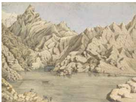
Plate 7 - H.A. Oldfield, View of 'Sooriy-Koond' & 'Goosainkoond' © The British Library Board WD.3331.

that there are at least two different versions of Oldfield's well known picture of the Golden Gate at Bhaktapur, with identical architectural detail but with different colour wash and figures (Plate 8).