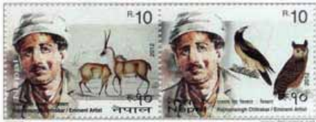
Plate 2 - Rajman Singh Chitrakar, Nepal Eminent Painter, 2 Stamp Set, Nepal Mint 2013.

natural history watercolours attributed to him show precise details of birds and animals, resulting from training by Hodgson based on scientific study of anatomy and dissection. Raj Man Singh signed many of his works in Nagari script, thus moving away from the traditional anonymity of the Chitrakar caste. His natural history paintings have recently been commemorated in Nepal by the issue of a special stamp (Plate 2).