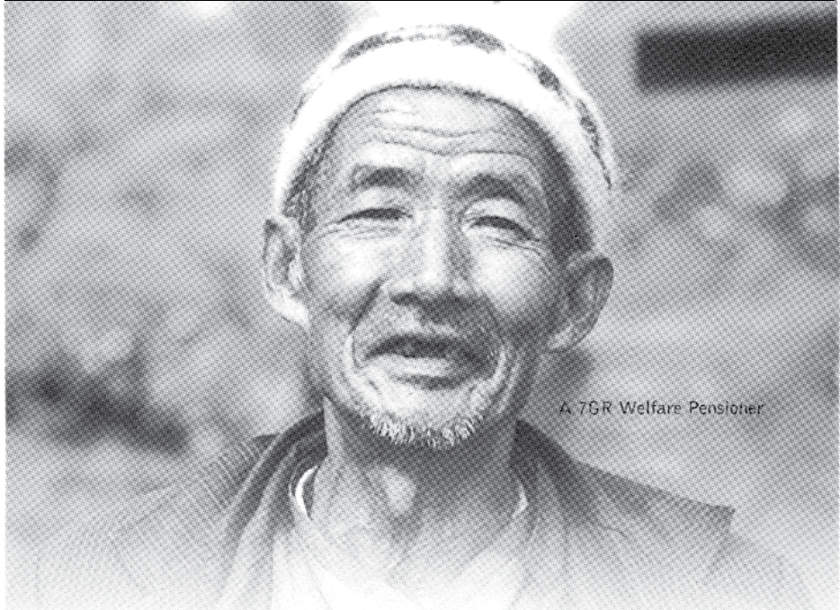
A TGR Welfare Pensioner

The day will come when an entire generation will exist who will be unaware of the debt of honour owed to the Gurkha soldier; a generation which cannot remember, as we do, the brave and loyal service Gurkhas have given to the British Crown over nearly two centuries.