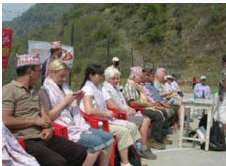
Prize giving ceremony