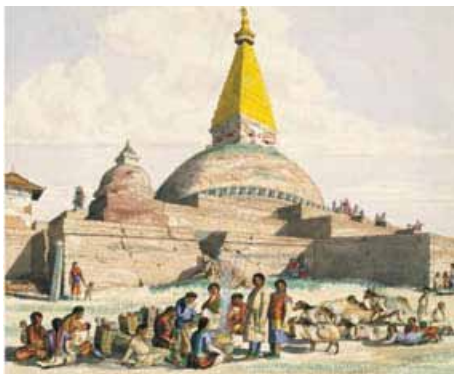
Plate 4 - H.A.Oldfield, Buddhist temple at Bodhnath - Tibetans & their sheep at the stupa at Bodhnath

rural temples in the mountains. But this was not just a romantic interest in decaying ruins. He took an interest in the current state of the buildings, and the cultural and social life associated with them. His written account of the Bodhnath temple the largest in Nepal, records the dimensions and structure of the building in mathematical detail. However he also makes other observations about the context and culture associated with the temple, noting that this is an ancient Tibetan temple, continuing to be a pilgrimage centre, and the painting depicts it surrounded by visiting shepherds from Tibet. (Plate 4)