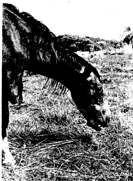
Fig. 4. Range horse breaking a ripe fruit of Crescentia alata between its incisors (19).

The postulated constriction of the range of C. alata after the extinction of the Pleistocene horse may affect other animals in the habitat. For example, nectarivorous bats would be affected by a reduction in jicaro density. The flowers of C. alata are nocturnal, abundant, and heavily visited by four species of nectarivorous bats in Guanacaste deciduous forests (24), and are the only common nectar source available to bats in the park forests during several months of the rainy season. The decline of the jicaro