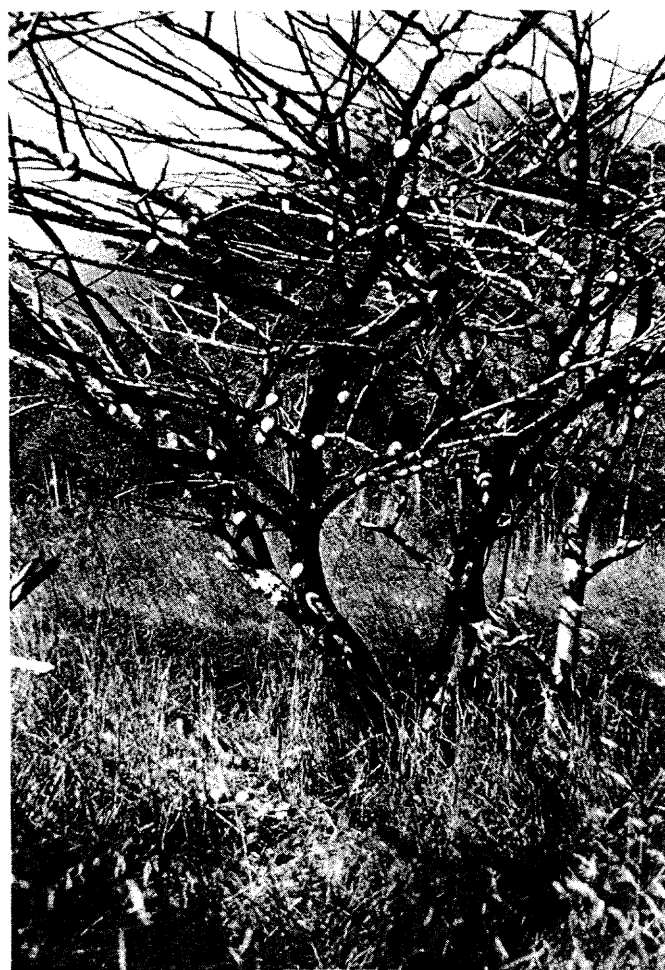
Fig. 3. Adult Crescentia alata with full-sized immature fruit during the dry season. Naturally fallen ripening fruits are visible on the ground to the left of the tree (19).

When range horses are free to forage below the trees, they quickly consume the crop of jicaro fruits. The hard fruits are broken between the incisors (Fig. 4), an act that requires a pressure of about 200 kilograms (22). The gooey pulp is scooped out with the tongue and incisors and swallowed with little chewing. For more than ten consecutive days, three captive and well-fed range horses ate the fruit pulp of 10 to 15 fruits in each of two meals a day, one in the morning and one in the evening (22). A herd of 17 range horses broke and consumed 666 jicaro fruits in one 24-hour period (22). The percentage of seeds that survive passage