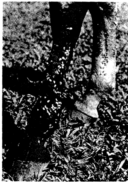
Fig. 5 (left). Spines, 7 to 11 centimeters long, on the underside of the petiole of the leaf of sapling Acrocomia vinifera (19). Fig. 6 (right). Desmodium (Leguminosae) beggar's-ticks stuck to the forelegs of a free-ranging horse on the edge of the Costa Rican rain forest (38).