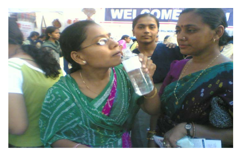
Figure 2: People trying out dew water at a public fair