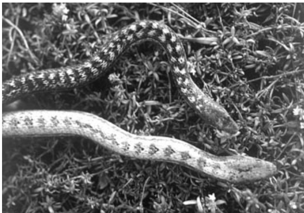
Plate 2 Male (top) and female (bottom) Antigua racers.

A total of 169 individuals have been captured since 1995 as part of the ARCP research programme (see below), 159 of which have been permanently marked with 14 mm passive integrated transponder (PIT) tags to enable project staff to monitor individual growth rates and survivorship. Eighty individuals were captured in 2 or more years and these exhibited highly variable growth rates between captures. Even within each gender, neither body length nor mass can be used as a reliable indicator of the age of adults.