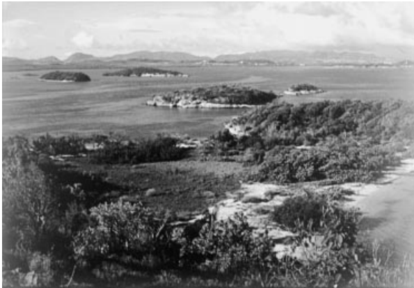
Plate 1 Great Bird Island (Mark L. Day).

had seriously injured more than half of the population (see below).