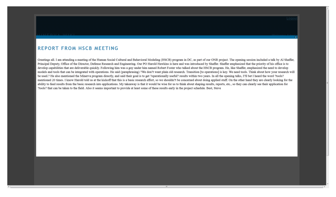
Figure 6.3 Screenshot of the Email content page for a Single email