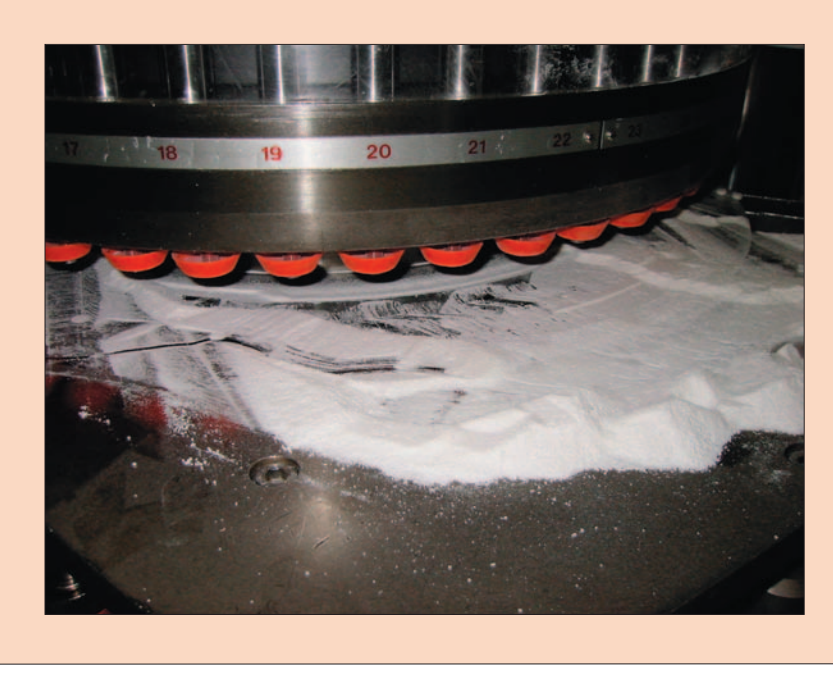
Removing the feeder from this tablet press reveals segregated powder, which ultimately leads to weight fluctuations. Running the feeder too fast is one cause of segregation.

slowly as possible while maintaining proper tablet weight. Running the feeder too fast can also cause the product to segregate. See Figure 2.