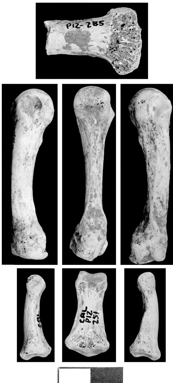
Fig 3 Caldeirão 7 to 9 postcrania. Top: Caldeirão 7 right proximal radius in lateral view. Middle left to right: Caldeirão 8 left metacarpal 4 in radial, palmar and ulnar views. Bottom left to right: Caldeirão 9 middle hand phalanx in right lateral, palmar and left lateral views. Scale in centimeters.