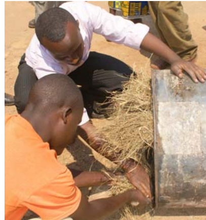
Figure 8: Make 'wicks' in the bottom of the oil drum.

wick, allowing you to easily ignite the material at the bottom of the drum.