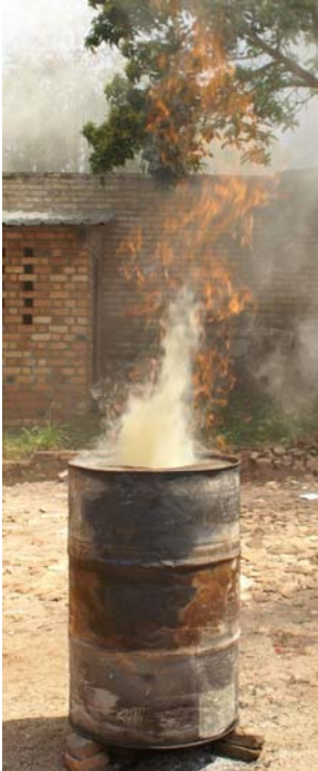
Figure 11: When the smoke is darker, carefully set fire to it.