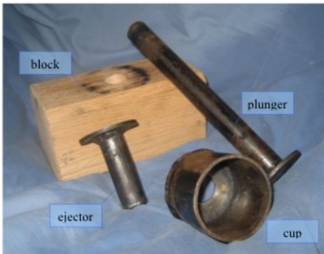
Figure 6: Parts of the briquette press.