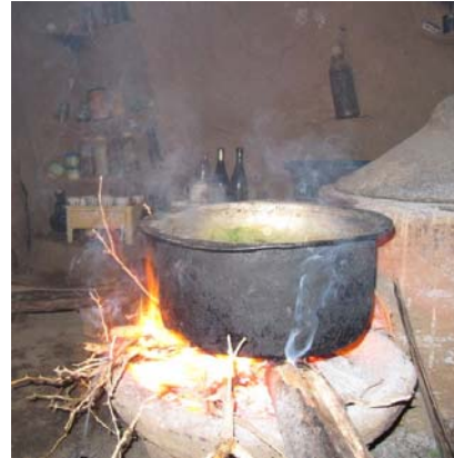
Figure 1: Indoor air pollution from cooking with biomass is associated with pneumonia.

Worldwide, 2.4 billion people use wood, charcoal, other plant material (biomass), and coal as their primary source of cooking fuel. In developing countries, the burning of biomass accounts for up to 80% of all household fuel use. Widespread burning of unprocessed biomass has well-characterized impacts on health and the environment. Indoor air pollution, which is largely due to exposure to smoke and particulate matter emitted by the combustion of unprocessed biomass, is estimated to kill over 1.6 million people each year (figure. 1); women and young children are worst affected. Deforestation also causes soil erosion, increasing vulnerability to flooding and causing lower crop yields from farms.