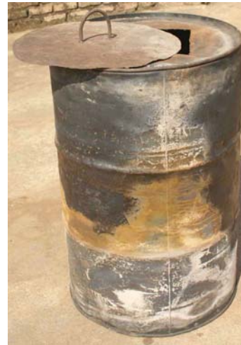
Figure 2: A steel oil drum with lid forms the kiln.

A 55-gallon steel oil drum (figure 2). This forms the kiln, in which the waste is burned, to produce charcoal. Oil drums are used to transport crude oil and other materials throughout the developing world; they are readily available and cheap, costing around $10-20. A lid for the oil drum is also needed , which can be made out of scrap metal.