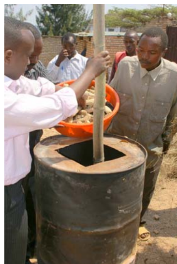
Figure 7: Fill the drum with a central chimney.

When filling the drum, it is necessary to allow air to flow through the drum so that the fire can burn hotly and evenly and produce high quality charcoal.