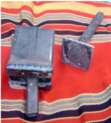
Figure 3: A briquette press, made from angle iron and sheet metal.

A briquette press (figure 3). This is a small, cheap impact press, which costs around $2-3 in the developing world, and is used to make briquettes from carbonised powder.