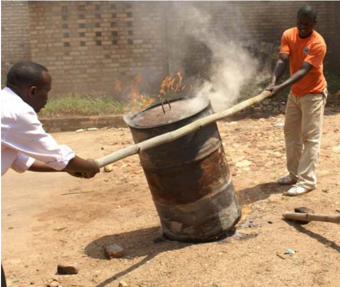
Figure 13: Gently lower the drum to seal off the air holes on the bottom.

The agricultural waste will slowly carbonise inside the hot oil drum. After 2-3 hours, when you are sure that the drum has cooled, you can remove the lid.