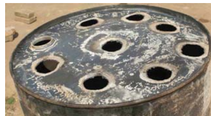
Figure 5: 9 small air holes in the bottom of the drum.

Cut about 9 small air holes (figure 5) in the bottom of the drum to allow for air to flow through it, making a hotter initial fire. The air holes should be evenly distributed and roughly 8cm apart. One air hole should be near the centre. They can be any shape, but no more than about 8cm in diameter, to stop material falling through the holes.