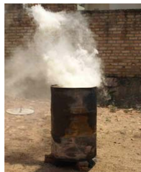
Figure 10: The first, light plume of smoke.

Take care to stand upwind from all the smoke, to avoid inhaling it.