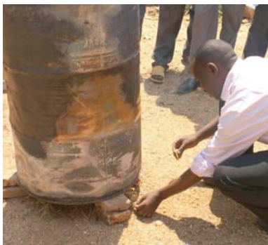
Figure 9: Raise the drum on three flat stones, and light the wicks at the bottom. Photo credit: Fuel from the

Once the biomass is fully on fire, it will make a large, billowing plume of white smoke (figure 10).