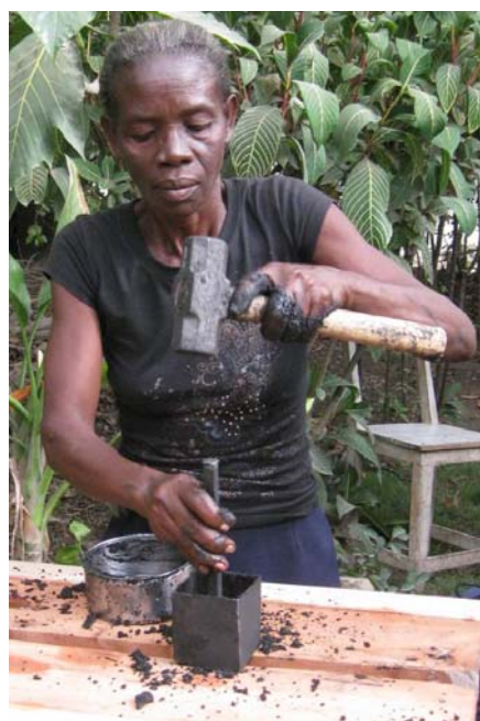
Figure 16: Using the briquette press