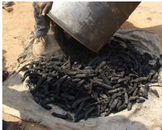
Figure 14: Fully carbonised corn cobs.