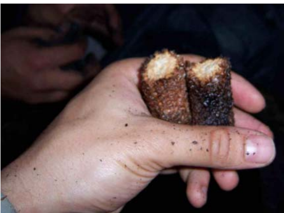
Figure 15: Corn cobs that are not completely carbonised.