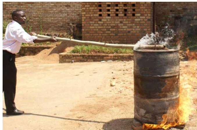
Figure 12. Place the lid on the drum

If flames shoot out from the edges of the lid or from under the drum, it is not yet ready to be covered, the lid should be removed and the material allowed to burn for a little longer.