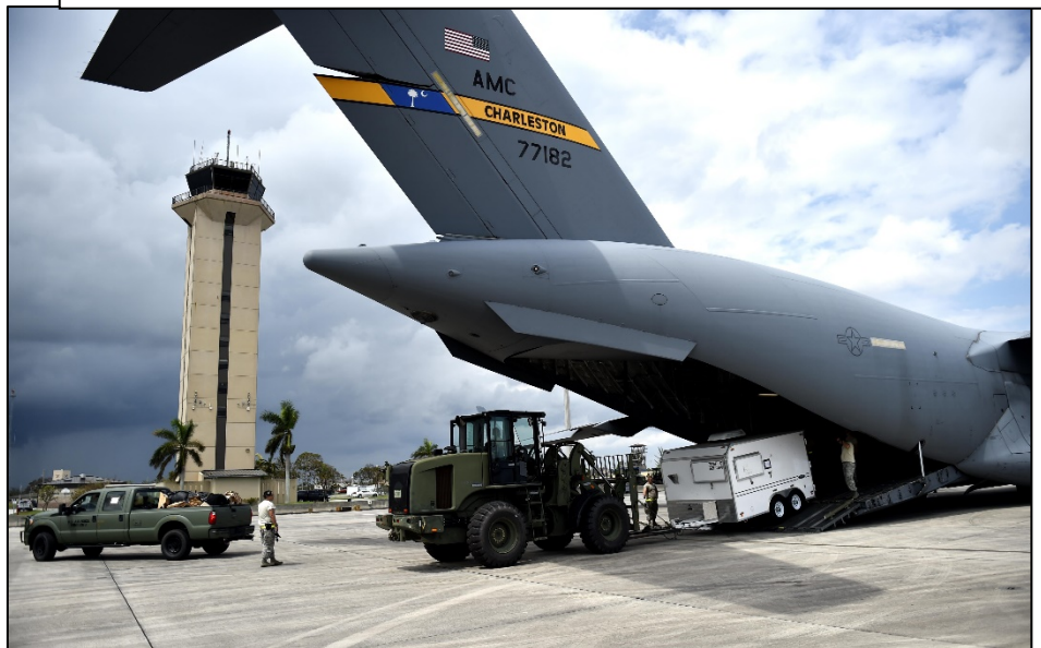
A C-17 Globemaster III, from Joint Base Charleston, SC loads up at HARB in support of Hurricane Irma relief efforts on 13 Sept 2017 as the base became a hub once again for another humanitarian mission