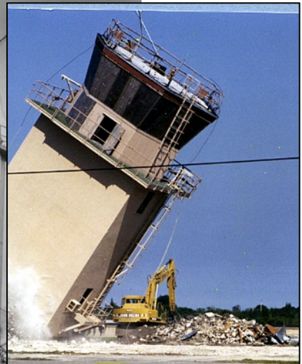
The old tower is being torn down to make way for a new one in this 1995 photo