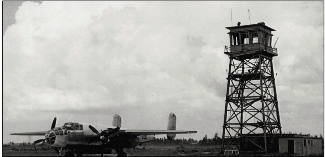
A photo showing post 1945 after Hurricane Nine during a period when HAAF was shutdown. The airfield still saw an occasional transient such as this B-25. A closer look at the tower shows all windows blown out and the ground still has building debris spread about

Twenty-four hours a day, seven days a week, for 16 months, Air Force C-54 "Sky Masters", many of them piloted by Homestead graduates, were winging into and out of Berlin, keeping one of the world's great cities alive.