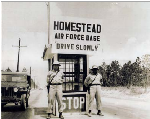
Front Gate of HAFB 1950-60s

In the early 1950s, as the Korean conflict was winding down, defense officials once again looked toward Homestead Army Air Field with an eye to making the site an integral part of our continental defense. In mid-1954, an advance party arrived at the old base to begin the clean-up effort, and on Feb. 8, 1955, the installation was reactivated as Homestead Air Force Base (HAFB). The base quickly became home for the 823rd Air Division, an umbrella organization encompassing the 379th and 19th Bomber Wings.