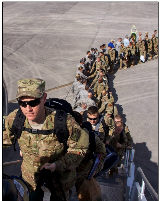
From 2001 and forward the tempo intensified greatly for Homestead ARB members training and deploying in support of contingency operations worldwide. In this January 2014 photo Airmen shake hands and say farewell to base leadership as they head out again to undisclosed locations

In 2013, the 482d Security Forces Squadron deployed members to Manas AB, Kyrgyzstan while base aircraft, pilots, and maintainers deployed to OPERATION GREEN FLAG, Barksdale AFB, LA, Naval Air Station Fallon, Nevada and also Hill AFB, Utah for battlefield combat and live fire training. On the base the same year, as the F-16s received major