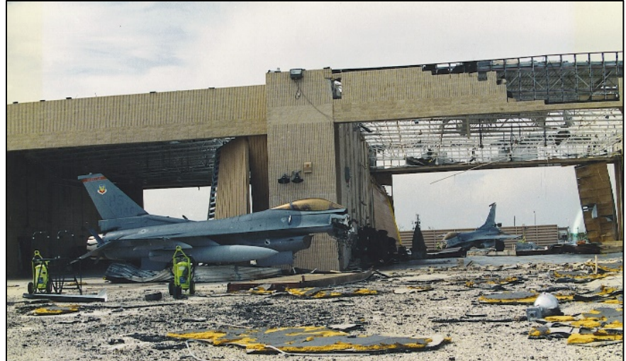
Damage shown to hangars and aircraft after Hurricane Andrew 1992. The base reopened in March 1994 and was re-designated Homestead Air Reserve Station (HARS) on 1 Apr 1994.

In initial rebuilding efforts, the DOD expended in excess of $100 million in new construction and infrastructure improvements to preserve Homestead AFB as a strategic national defense asset. Demolition of unusable buildings and repair of base infrastructure ensued. Re-constructing the Florida National Guard hangar, air traffic control tower and maintenance hangers became priority. Within just few short years after the hurricane, base was in the process of building brand new facilities such as the wing headquarters, vehicle maintenance, communications, medical, and security facility buildings.