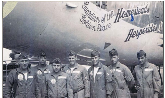
An aircrew from the 19 th Bomb Wing stationed at HAFB in 1962 pose for a picture in front of their B-52H "Homestead's Hesperides X" that broke a world record for distance in a closed course without landing or refueling

Troops and aircraft were rushed to Homestead AFB, swelling its population by tens of thousands. A tent city of more than 10,000 Army troops sprang up. The 31st TFW, in cooperation with two other tactical fighter wings assigned here for the duration of the crisis, had already identified targets in Cuba and were prepared to strike at a moment's notice. The world was on the brink of war, with Homestead on the leading edge.