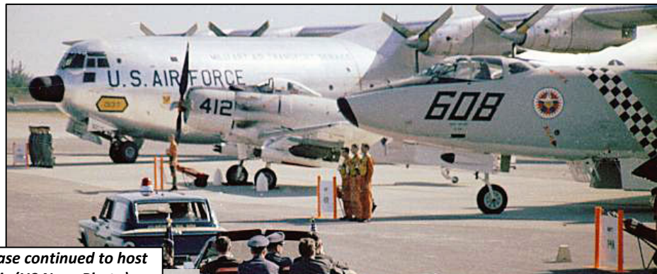
The President reviewing aircraft and crews at HAFB 26 Nov 1962 as the base went through a build-up during the Cuban Missile Crisis