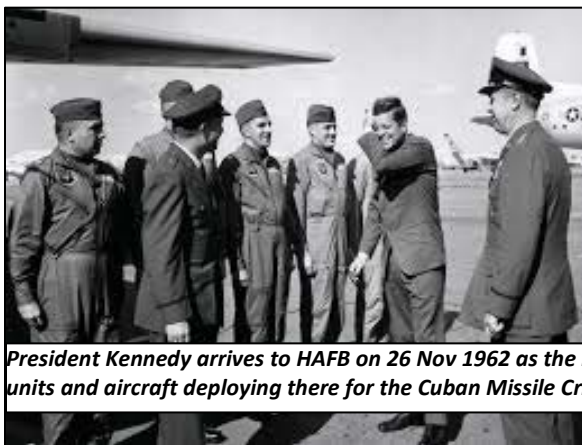
President Kennedy arrives to HAFB on 26 Nov 1962 as the base continued to host units and aircraft deploying there for the Cuban Missile Crisis