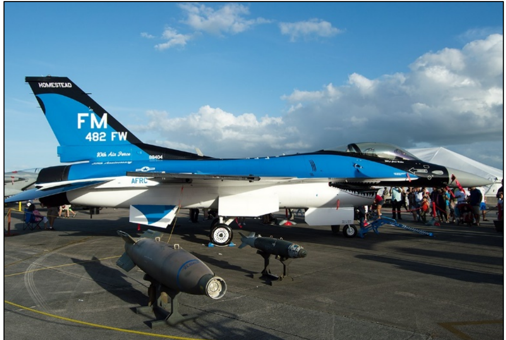
The flagship Mako Jet for the 482 FW stands proud on static display for the crowds at the Wings Over Homestead Air Show 6 Nov 2016

As we look toward the future, the 482nd FW continues to provide the Department of Defense with an efficient, cost-effective air reserve base on the rim of the Caribbean Basin. Its strategic presence at the southernmost tip of the continental United States provides an invaluable platform from which to launch its full range of capabilities. Poised to protect and defend, readiness is its primary mission. Whether responding to real-world contingencies and tasks in support of homeland defense or performing its on-going mission of training America's finest citizen Airmen, the 482nd FW is "Ready to Win", and consistently lives its vision of service before self, integrity first, and excellence in all we do.