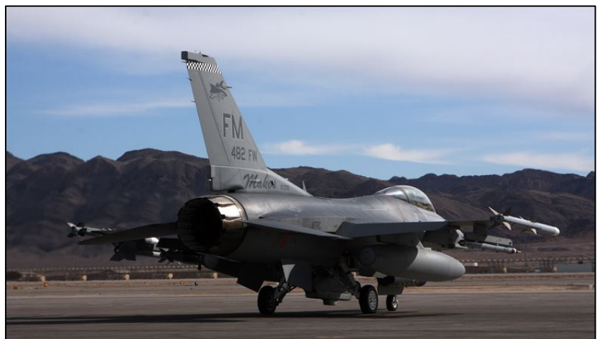
An F-16 "Mako" jet from Homestead Air Reserve Base, Fla. taxis onto the runway of Nellis Air Force Base, Nevada., to participate in Red Flag, 26 Jan 2010.