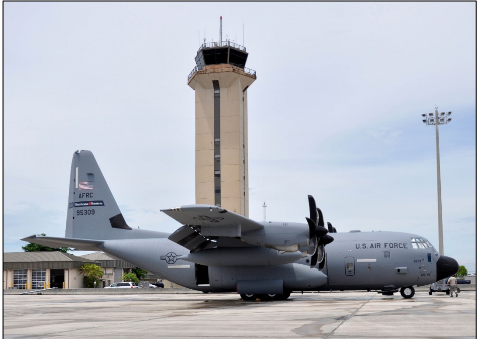
A familiar sight seen most every year at HARB during hurricane season, a WC-130J Hurricane Hunter from the 53rd Weather Reconnaissance Squadron out of Keesler AFB, MS sits on the tarmac in front of the tower in this 27 Aug 2015 photo

Through history, Homestead ARB has and always will have to deal with hurricanes due to its location. What ended the year in 2017 and put Homestead ARB again at the forefront of historical humanitarian relief efforts was the hurricane season. As the hurricane stayed to the west. As wing members were both returning home from and deploying to Southwest Asia missions, base Hurricane Operations started as Hurricane Irma headed towards South Florida and the base prepared by evacuating F-16 aircraft and crews out to Naval Air Station Fort Worth Joint Reserve Base. On Sept 10, 2017, Hurricane Irma went through the Florida Keys and then through the peninsula. The base only suffered minor damages. The 125th Detachment of the Florida Air National Guard at Homestead ARB lost most of its hangar roof, but resumed its air defense mission with its F-15