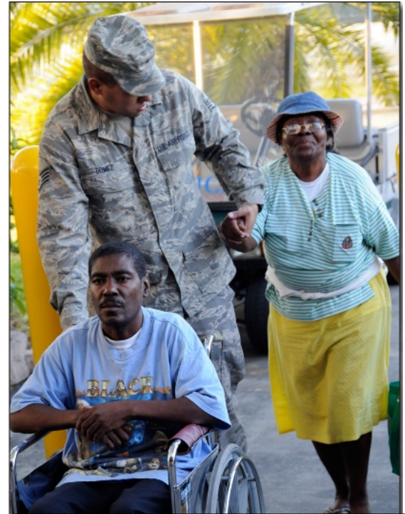
A 482nd Fighter Wing's Civil Engineering Squadron Airman helps move American survivors of the Haiti earthquake into the Sam Johnson Fitness Center at Homestead ARB, Fla.

The year 2010 also saw the return of the 93rd Fighter Squadron to the Red Flag exercise after a 16 year absence. The last time Homestead ARB attended Red Flag was in 1994. The advanced aerial combat training exercise held at Nellis AFB, Nevada prepared Homestead ARB fighter pilots and maintainers for integrated joint operations in air-to-air and air-to-ground combat. At the end of the year, Homestead ARB aircraft, pilots, and maintainers put their honed skills to the test with a deployment to Kunsan AB, South Korea.