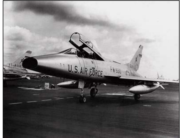
An F-100 Super Sabre on the HAFB flight line in 1964

During that period, the largest tenant unit on Homestead AFB was the 482nd Tactical Fighter Wing of the Air Force Reserve Command. The 482d TFW was the first Air Force Reserve unit to receive the F-4 Phantom fighter jet. In 1989, the 482nd TFW converted to the F-16s.