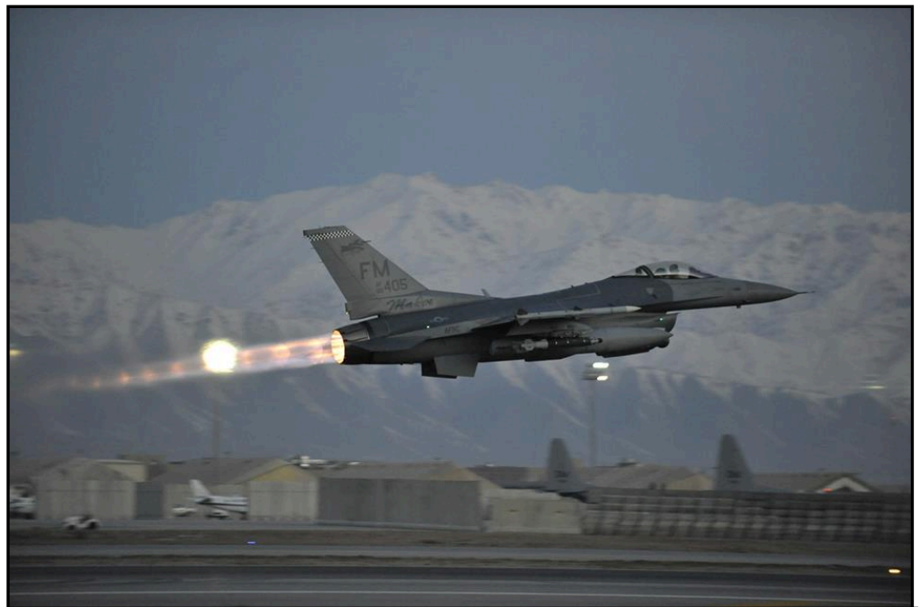
A 482 Fighter Wing F-16 Fighting Falcon, Mako jet, takes off on a mission at dawn from Bagram Airfield, Afghanistan on 11 February 2014.

In January 2017, the 482 Mission Support Group (MSG) deployed hundreds of Airmen from the base to several air bases in Kuwait for support of Operation Inherent Resolve. By the end of the year members from Force Support, Security Forces, Civil Engineering, Logistics Readiness,