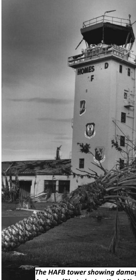
The HAFB tower showing damage after Hurricane Andrew