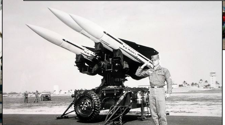
An army soldier salutes JFK as he passes by one of the deployed HAWK missile units at HAFB 26 Nov 1962. The HAWKS were deployed everywhere to beef up defense, even on the beaches at Key West. The base tower can be seen in background