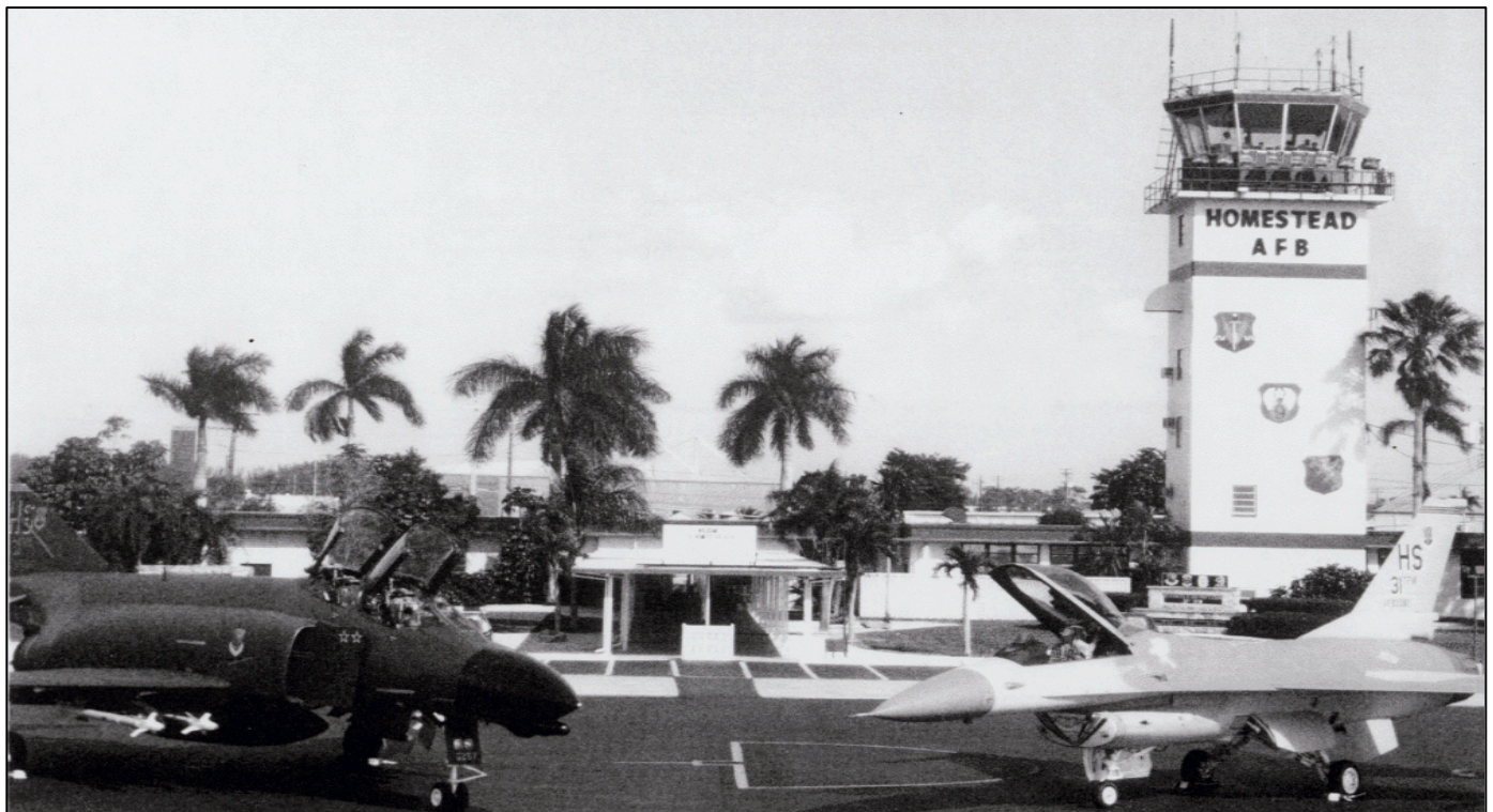
An F-4 Phantom and F-16 Falcon are shown in the August 1992 photo in front of the tower a mere month before Hurricane Andrew struck the base.