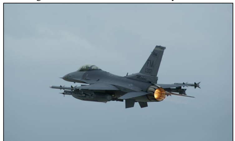
An F-16 departs Homestead Air Reserve Base in this 28 Jan 2008 photo

In November of 2009, Homestead ARB hosted its first Air Force sponsored air show in 18 years, featuring the U.S. Air Force Thunderbirds as the headlining act. The air show was a complete success and marked the beginning of many more to come. In November of 2010, Homestead ARB hosted