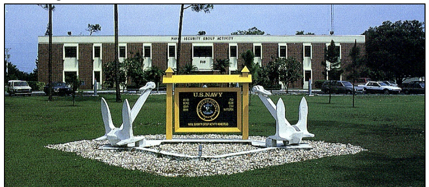
Building 346 ca.1980-1990 then owned by the Navy