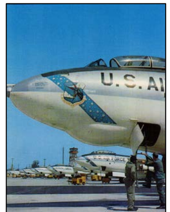
B-47s line the HAFB tarmac in this 1950s postcard picture

By the end of the decade, Homestead AFB housed more than 6,000 permanently assigned members, twice the size of its busiest World War II days, and a fleet of B-47 "Stratojet" bombers. In June