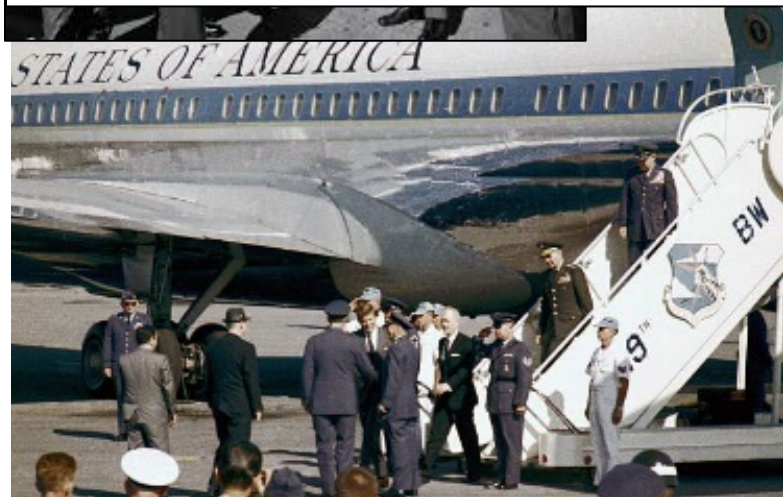
A Photo of President Kennedy arriving at HAFB with the Joint Chiefs of Staff to recognize Air Force and Army units during the Cuban Missile Crisis 26 Nov 1962. The 19 th Bomb Wing (19 BW) hosted the base at that time