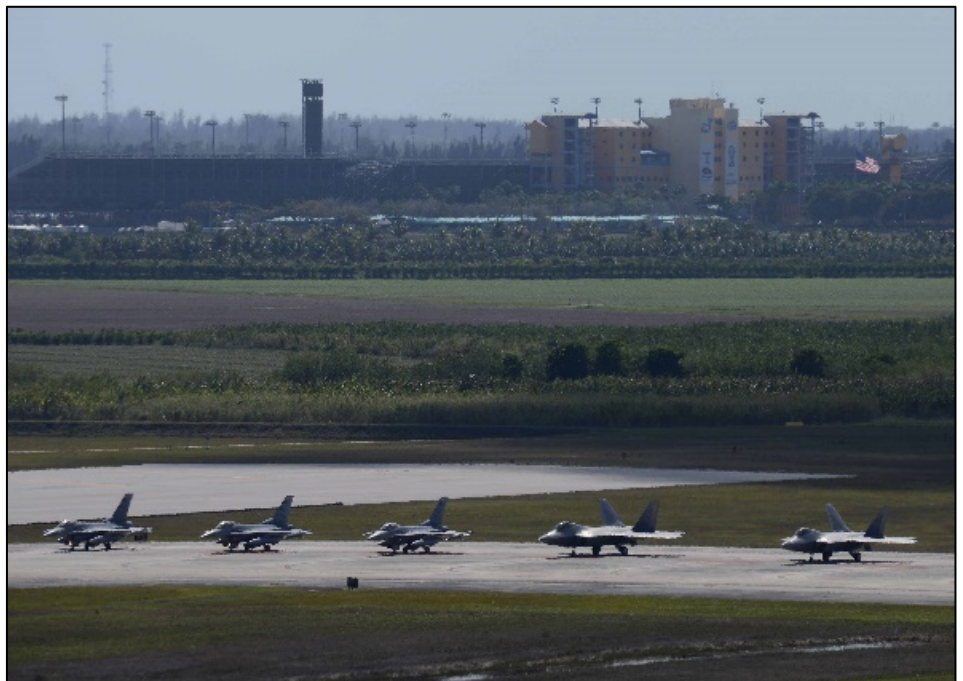
A possible sign of things to come for HARB, both F-16 and F-22 aircraft wait for clearance from the tower to take-off on 2 Mar 2015 during the CHUMEX at Homestead Air Reserve Base, Fla.

The year 2015 brought several historic events unfold at Homestead ARB. Renovations that started in 2013 for survivor of Hurricane Andrew, Building 346 completed. Then, on 23 October 2015, Homestead ARB’s historic Total Force Integration (TFI) initiatives took center stage as the active duty 495th