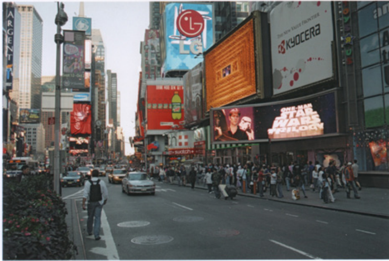
Another One Man Star Wars marquee—New York City (pop. more than 300), 2005.

However, in grown-up world, intellectual property lawyers have a way of ruining your fun.