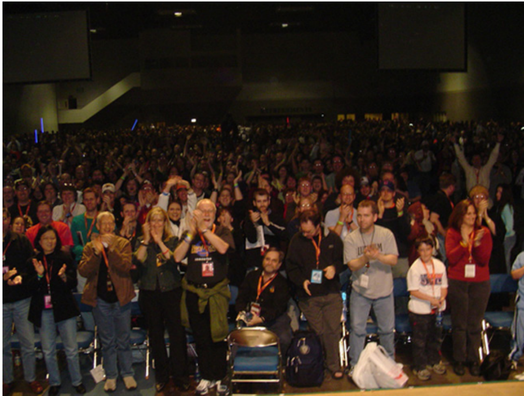
The Lucasfilm "audition." It went very, very well.

acting. I had to recapture the genuine love, the uncensored fanatical gusto reserved for eight-year-olds and lunatics. I needed to find my inner eight-year-old and transpose him to the stage. People would either get it or they wouldn't.