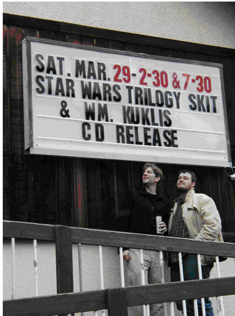
The first One Man Star Wars "skit" marquee, Silverton, BC (pop. 300, maybe), March 2003. Your show being referred to as a "skit" is not quite a solo actor's dream, but a marquee is a marquee, no?

When I rehearse a play with other actors, my character takes shape in relation to the rest of the cast. We bounce off each other, and eventually the play comes together. Then we go for beer, or wine, or both. One-person shows are very different. While rehearsing One Man Star Wars , I discovered it wasn't enough to go through the motions of