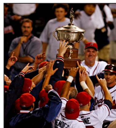
The Richmond Braves and their fans celebrate winning the 2007 Governors' Cup at home.

Game 4 @ Durham Bulls Athletic Park (Durham, NC) Game 3 @ PNC Field (Moosic, PA) Game 4 @ Durham Bulls Athletic Park (Durham, NC) Game 4 @ Coca-Cola Park (Allentown, PA) Game 3 @ Knights Stadium (Fort Mill, SC) Game 4 @ McCoy Stadium (Pawtucket, RI) Game 5 @ Durham Bulls Athletic Park (Durham, NC) Game 5 @ Victory Field (Indianapolis, IN) Game 4 @ Coolray Field (Lawrenceville, GA)