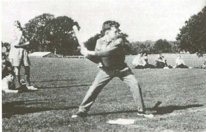
Participants in the Baseball Baptism Program in Great Britain.

Because the chasm between I-Thou and I-It lies within a person's internal motivation, external actions might not identify which relationship governs. In the case of proselytizing, a person may "convert" for I-It motivations, while the missionary teaches and baptizes the same convert for I-Thou reasons. And vice versa. However, external actions sometimes are so exploitative as to remove all doubt that I-It relationships are occurring.