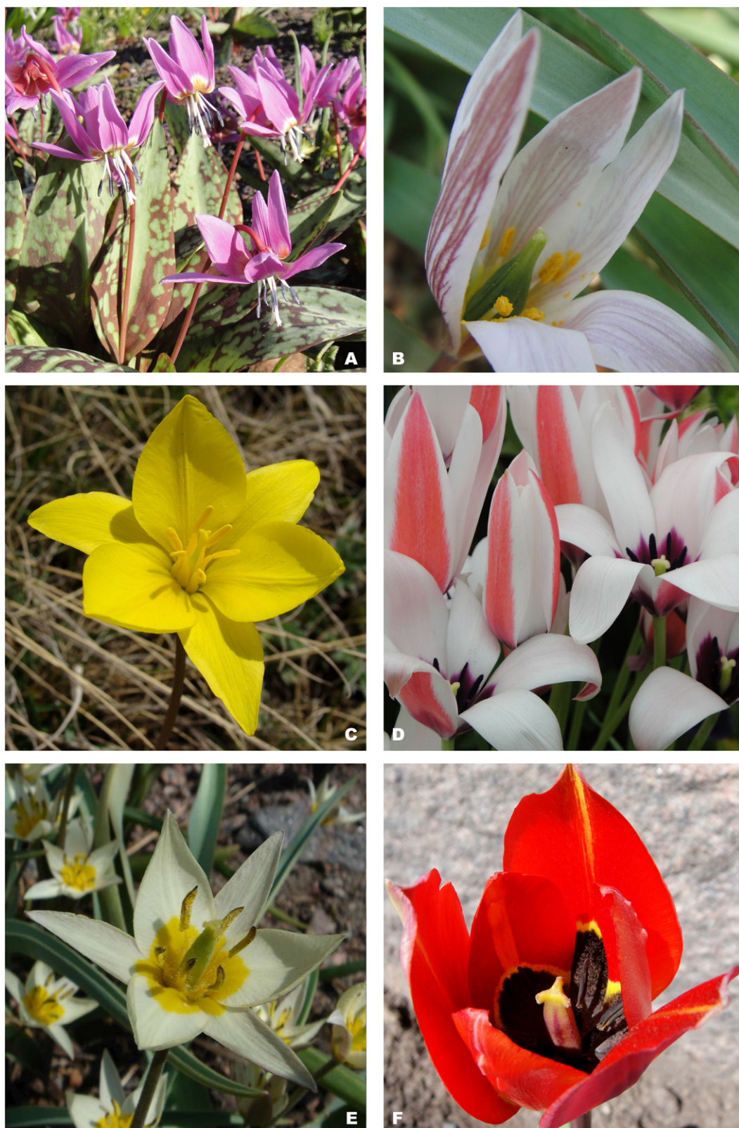
Figure 2. The Tulipa clade of Liliaceae tribe Tulipae. A, Erythronium dens-canis . B, Amana edulis . C, Tulipa uniflora (subgenus Orithyia ). D, Tulipa clusiana (subgenus Clusianae ). E, Tulipa turkestanica (subgenus Eriostemon ). F, Tulipa agenensis (subgenus Tulipa ).