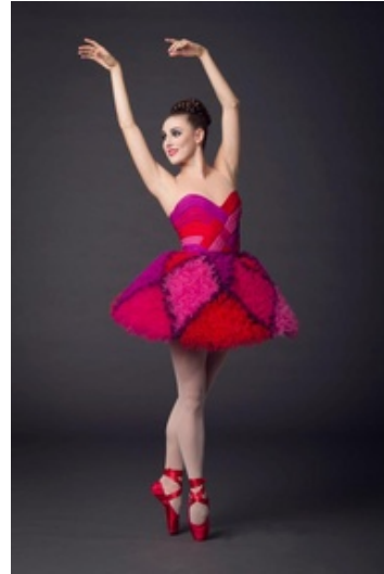
Tiler Peck current Principal NYCB

“It’s hard to be the only black dancer,” she said. “You feel separate, and you feel negated in a certain sense, and it’s not that people are trying to make you feel bad, but it’s just obviously around you. Everyone else can bond by similarity, and you have to make an effort, and making an effort makes you wonder, ‘Am I not being true to myself?’ It’s hard to be strong enough to be in that environment and to not feel wrong. It was very difficult. I fought my way through the school, and I felt like I continued fighting through the company — fighting with the image that I had of myself.”