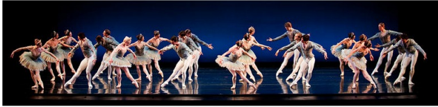
Cincinnati Ballet Dancers | Theme & Variation - George Balanchine