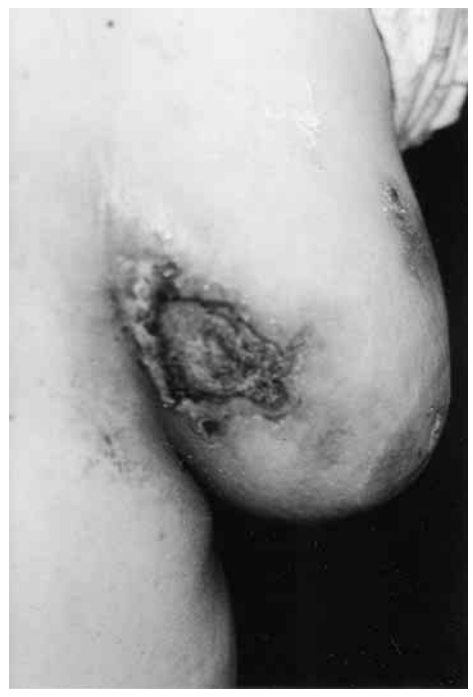
Figure 3. Ulcerated nodule draining an oily thick brown material

Initially, the treatment was primarily supportive. Although a slight improvement in her laboratory values was detected, during this therapy the patient developed abdominal pain, fever, and arthralgias, not responsive to support measures, thus requiring continuous sedation. The nodules failed to respond clinically, and older nodules spontaneously ulcerated, draining an oily thick brown material (Figure 3). Her condition deteriorated, and she became progressively debilitated. The patient died before operation, 1 month after the diagnosis was made. Autopsy was not conducted respecting the patient's family decision.