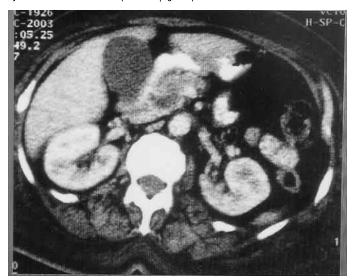
Figure 2. Large gallbladder, enlarged head and processus uncinatus of the pancreas with cystic expansive formation

Abdominal ultrasound showed dilated ductus choledochus and the main pancreatic ductus of diameters 15 and 10 mm respectively, and an enlarged head and processus uncinatus of the pancreas, which on computed tomography (CT) showed a well defined hypodensive polycystic expansive formation with dimensions of 25x5o mm, primary suggesting polycystic mucinous tumor of the pancreas (Figure 2).