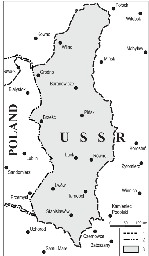
Figure 6. Eastern boundary of Poland (1921-1939 and after 1945). Signatures: 1 – eastern boundary of Poland according the Treaty of Riga (March 18th, 1921); 2 – eastern boundary of Poland according to the Polish-Soviet agreement of August 16th, 1945; 3 – territories lost by Poland to the advantage of the USSR.

As a consequence of the loss of eastern territory and the gain of a significant compensation in the west, Poland re-emerged in a new, completely transformed territorial shape. After the enormous resettlements of the population, Poland became an ethnically homogeneous country. The overall losses and gains can hardly be precisely balanced. Wrocław, Szczecin, Gdańsk and Olsztyn became Polish cities. Besides, Poland gained a broad seacoast. The eastern boundary of Poland moved far to the west, from the dividing line established through the Treaty of Riga to – roughly – the Curzon Line. At the same time, the western boundary was moved from the line determined by the Treaty of Versailles to the course of the Odra and Nysa Łużycka Rivers. For these reasons, in the assessment of the consequences of the Polish eastern boundary being established according to the Curzon Line, the comprehensive balance of territorial changes, having ultimately led to the appearance of Poland within the boundaries decided in Yalta and Potsdam, must be accounted for.