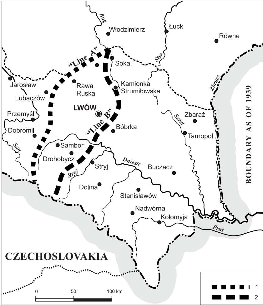
Figure 2. Division of Galicia according to the later Curzon Line (variants ‘A’ and ‘B’). Signatures: 1 – Curzon Line ‘A’; 2 – Curzon Line ‘B’.