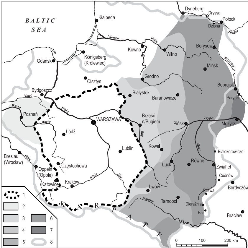
Figure 3. The effects of the military operations of the Polish army. Areas taken in the period between the end of 1918 and the beginning of 1920. Signatures: 1 – November 1918; 2 – January 1919; 3 – February 1919; 4 – May 1919; 5 – July 1919; 6 – August-December 1919; 7 – March 1920; 8 – Dmowski line.