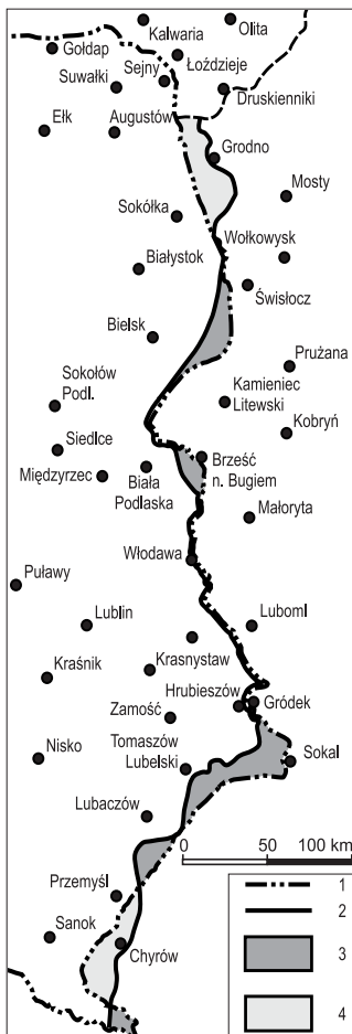
Figure 5. Post-war eastern boundary of Poland and the Curzon Line. Signatures: 1 – eastern boundary of Poland after World War II; 2 – the Curzon Line; 3 – areas situated to the east of the Curzon Line that were incorporated into Poland; 4 – areas situated to the west of the Curzon Line that were not incorporated into Poland.

The signed boundary agreement, though, made void in a definitive manner the partitioning treaty between Ribbentrop and Molotov. In relation to the demarcation line associated with that treaty, which existed between September 28th, 1939, and June 22nd, 1941, distinct changes took place to the advantage of Poland, amounting altogether to 22,000 km 2 .