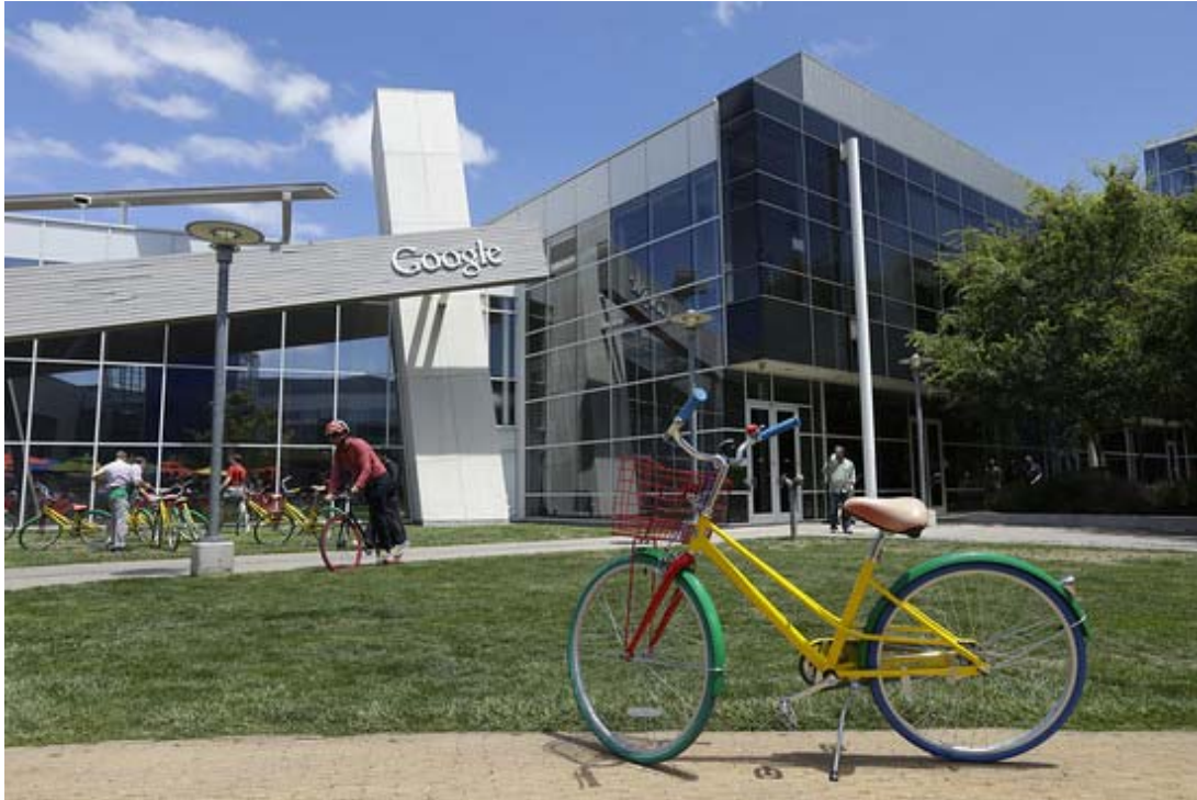
Google makes so much money that it is now worth three times more than every U.S. airline combined.

Monopolists lie to protect themselves. They know that bragging about their great monopoly invites being audited, scrutinized and attacked. Since they very much want their monopoly profits to continue unmolested, they tend to do whatever they can to conceal their monopoly—usually by exaggerating the power of their (nonexistent) competition.