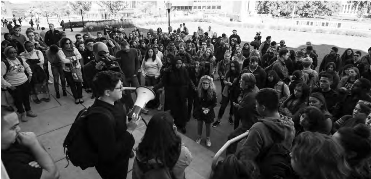
Students protest against hate speech

these subjects, probing their beliefs and actions about protest and free speech on campuses today.