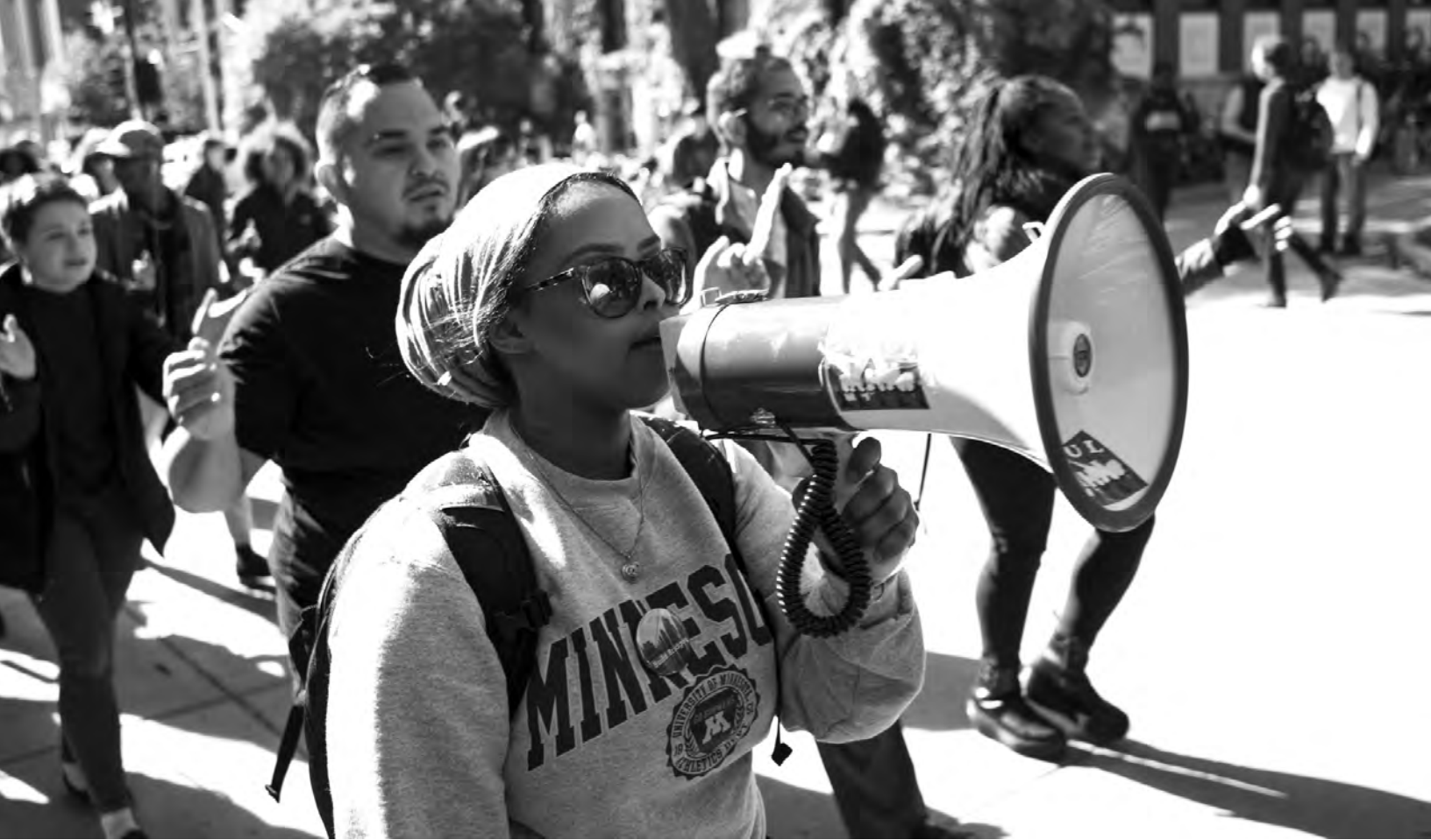
Students march for racial justice

They are asking whether universities that profess a commitment to access for students of color—or what I call “quantitative” diversity—will address demands for improving relational experiences in daily campus life—or what I call “qualitative” diversity.