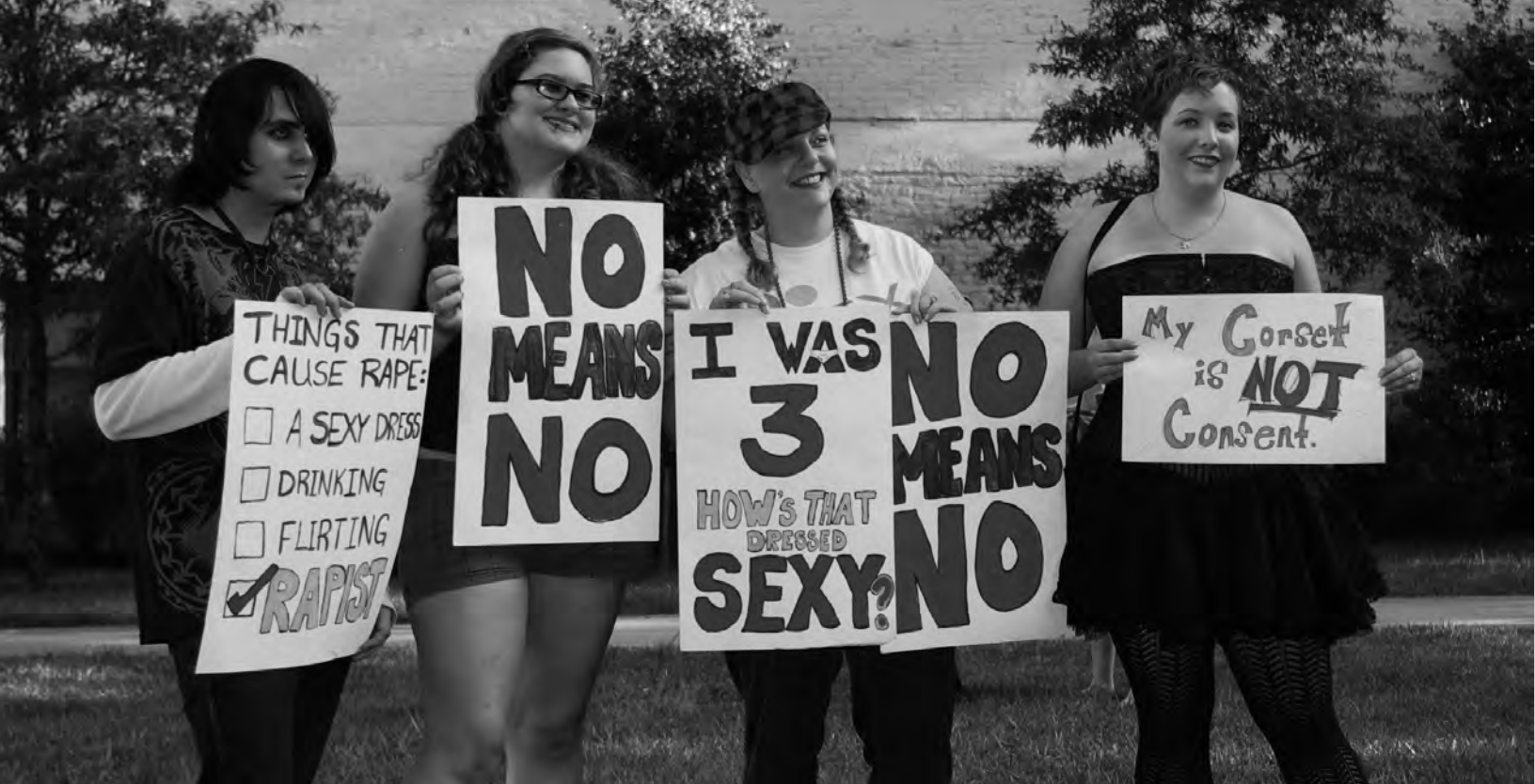
Marchers at Slutwalk in Knoxville, Tennessee to raise awareness for rape victims

Such harm can hamper students' self-confidence, increase anxiety, and hinder academic performance. Fostering education, sensitivity and thoughtfulness among all students and faculty about the challenges and offenses faced by groups that have historically been marginalized can be an honorable part of the university mission.