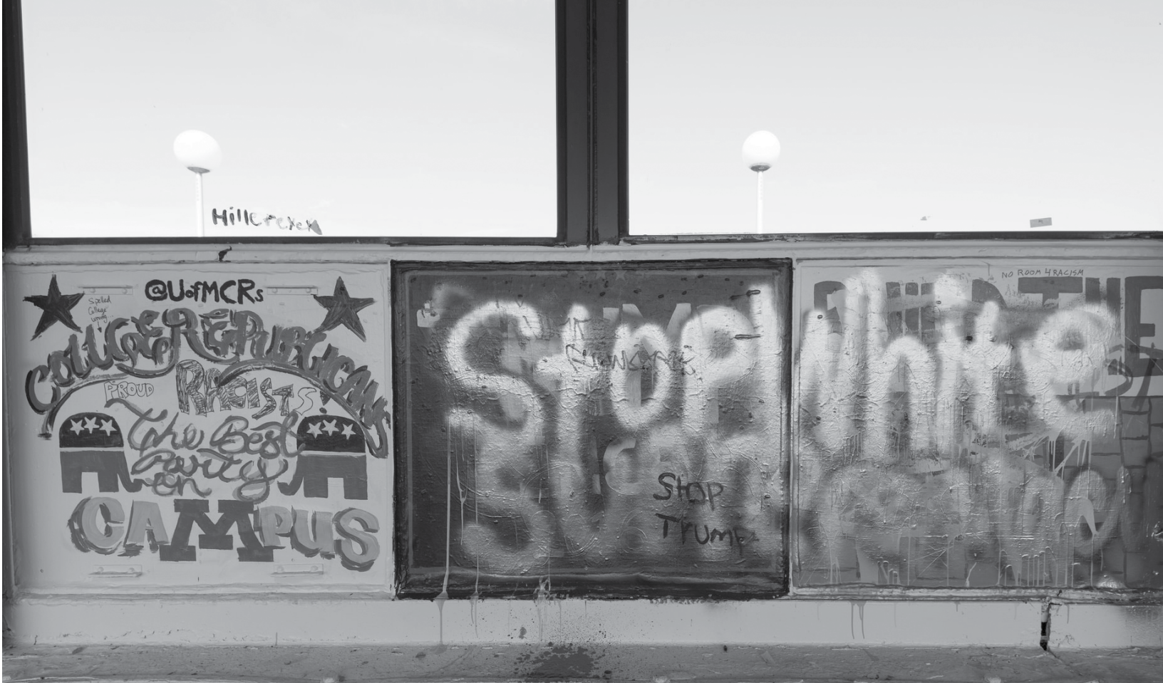
Political graffiti on campus

law professor and vice chancellor for equity, diversity, and inclusion, he said that the cumulative effect of these subtle dismissals was important to bring to the surface: