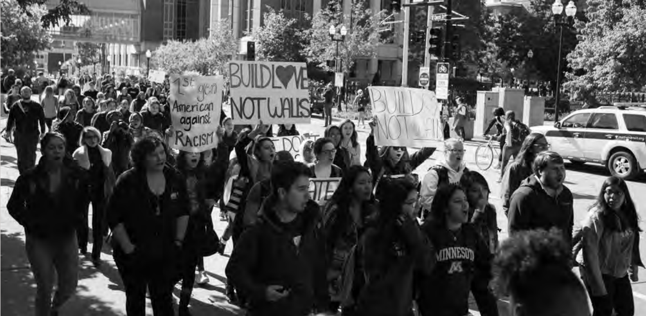
Students march in anti-Trump demonstration

That a campus event may be colored by protests should also not factor into a decision to withdraw an invitation. The university needs to have the integrity to stand by its choice and to embody the idea that divergent perspectives must be allowed to coexist, even if noisily, rather than allowing one point of view to simply shut out others. It is also important to consider that whereas some students may forcefully object to a particular speaker, there may well be others who wish to hear the speaker but have not voiced their views as vociferously. Individuals who are invited to speak and then targeted by protests should resist the temptation to withdraw, allowing hecklers a victory. Understandably, invited guests may find it uncomfortable to be at the center of a speech-related controversy, but to acquiesce in demands that they be silenced will make it easier for other noisy objections to win the day without so much as a fight. Far from a diplomatic solution, the voluntary withdrawal amounts to a form of pressure-driven self-censorship that in its own way restricts the terrain of acceptable speech.