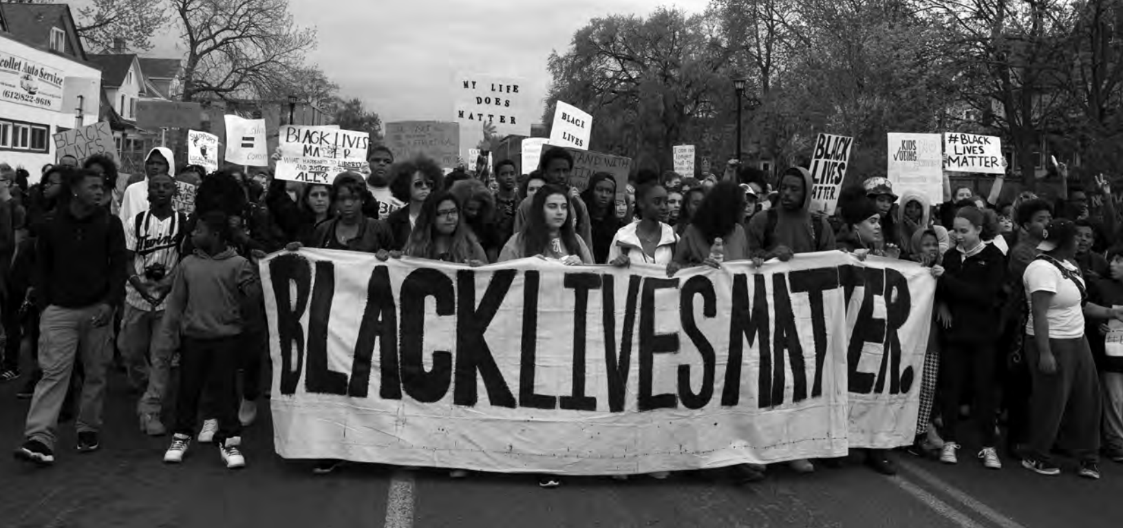
Students march for Black Lives Matter in Minneapolis, Minnesota