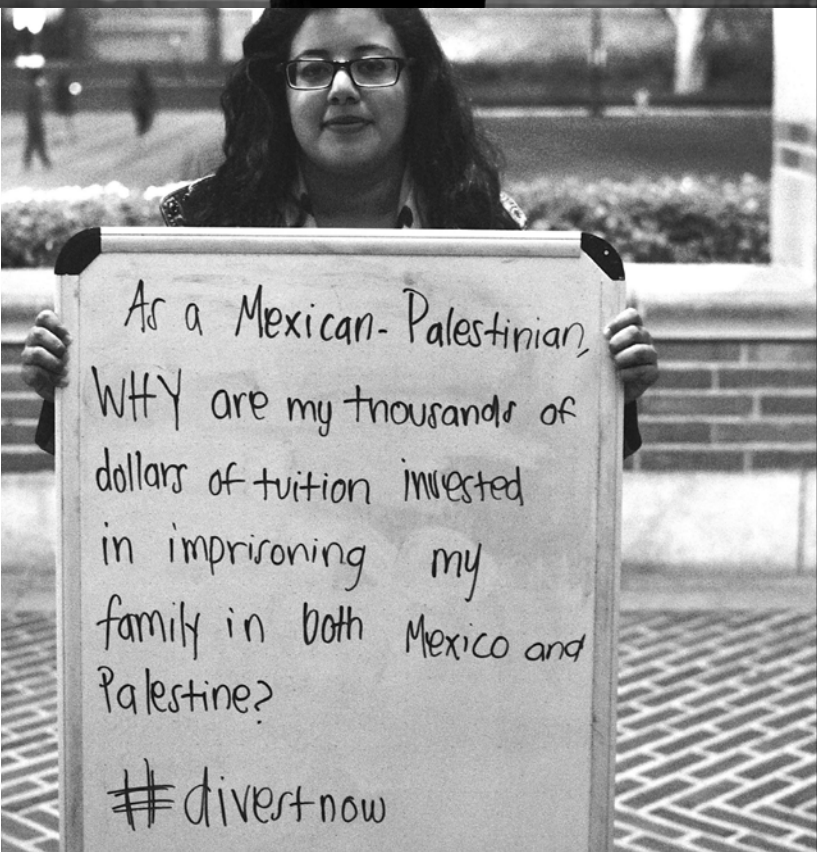
SJP-UCLA photo campaign: #DivestNow

the February 2014 BDS resolution failed, a cellphone video of a student government representative getting extremely upset about the loss was posted online under the heading “UCLA Student Melts Down After Divestment Defeat.” 404 The video has been viewed more than 115,000 times on YouTube and was commented on by pundits and outlets including conservative commentator Michelle Malkin, The