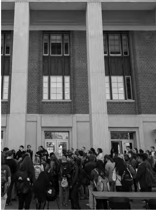
Students gather at library before a protest