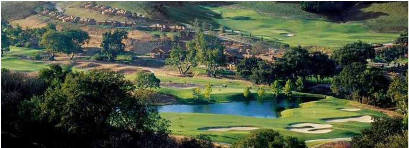
CordeValle, San Martin, Calif.

The PGA Cup, an international showcase event for PGA Professionals, will make its third visit to California in September 2015, and its second consecutive U.S. appearance at CordeValle in the countryside of San Martin, Calif., just 30 minutes south of San Jose. Opened for play in 1999, CordeValle attracted nationwide attention in 2010 and the acclaim of participants, hosting its first PGA Tour event, the Frys.Com Open, which has continued through 2013. CordeValle received rave reviews for hosting the 2011 PGA Cup and the 2013 U.S. Senior Women's Amateur Championship. It will serve as the site of the 2016 U.S. Women's Open.