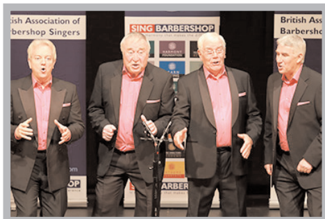
Timeless - 62.3%