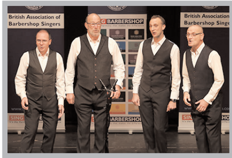
Shoreline - 58.5%