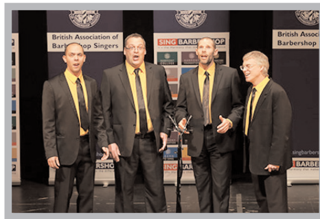
Diversion - 59.8%