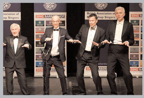
Incline - 65.9%