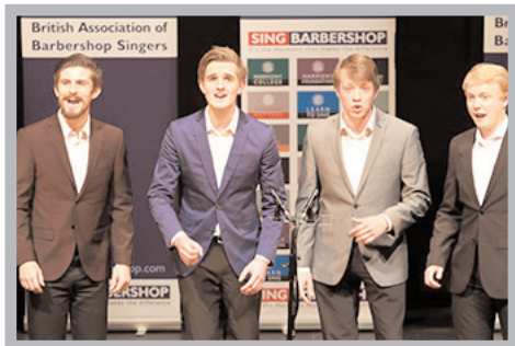
Student Unison - 63.2%