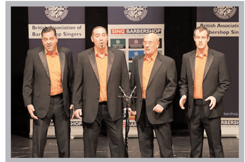
Wrekin Havoc - 63.1%