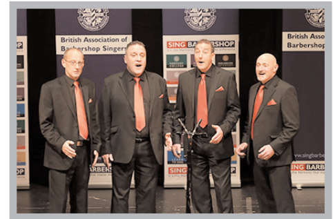
The Codebreakers - 52.1%