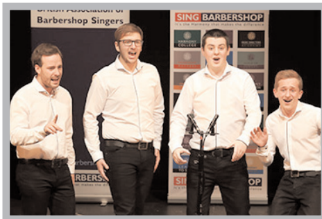
Wavelength - 62.6%