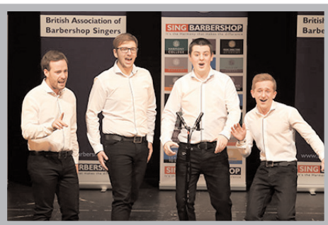
Wavelength - 62.6%