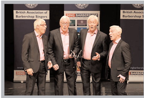
The Amazing Greys - 63.9%