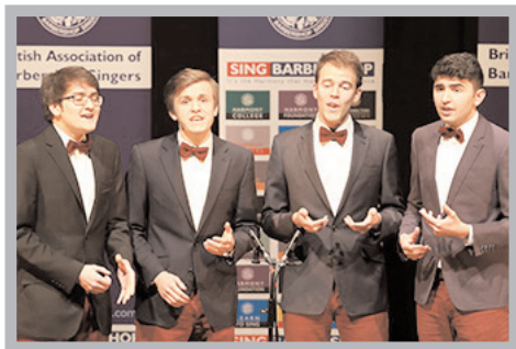
Sound Hypothesis - 70.6%