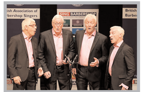
The Amazing Greys - 63.9%