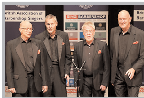
Waikikamukau - 58.8%