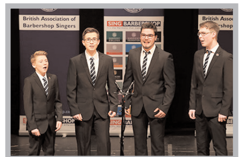
Diminished Fifth - 61.2%