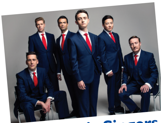
The King's Singers Internationally Acclaimed Vocal Ensemble