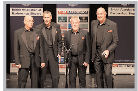
Waikikamukau - 58.8%