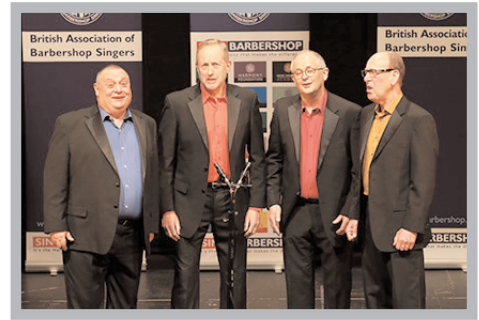
QM - 66.7%