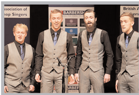
Harmonopoly - 69.9%