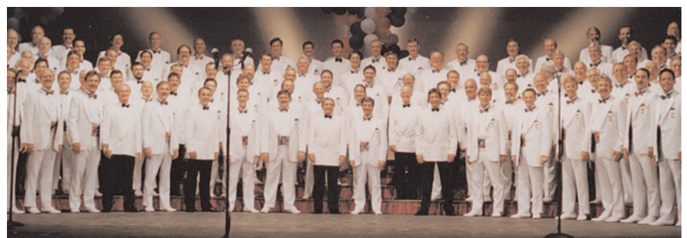
The Kingsmen with Masters of Harmony, Los Angeles 1994