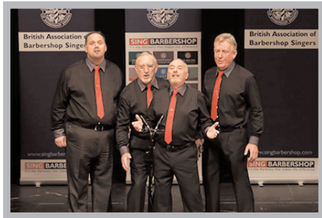
Cheers - 55.6%