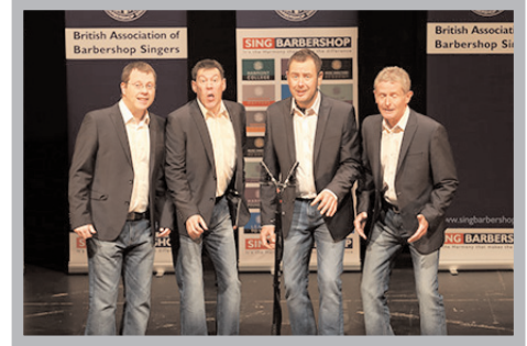
The Quadranaughts - 65.3%