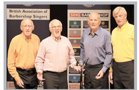
Intersection - 57.8%