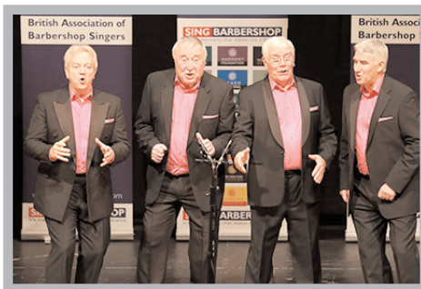
Timeless - 62.3%