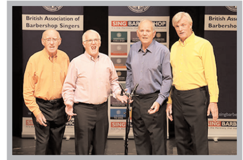
Intersection - 57.8%