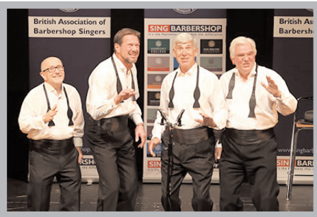
Cemetery Junction - 65.2%