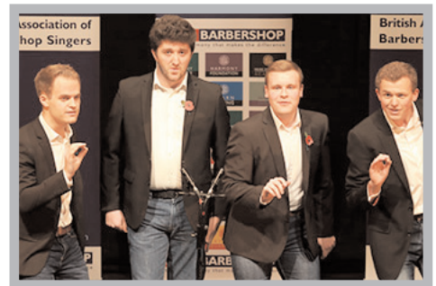
Northern Quarter - 68.6%