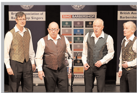
Oakie Dokie - 61.4%