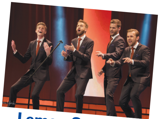
Lemon Squeezy 2016 International Silver Medal Quartet

9.00pm Saturday 27th May 2017 - Tickets £30