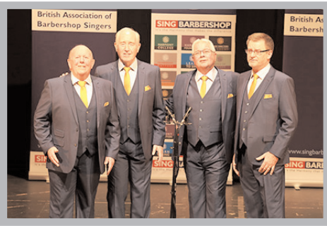
Three 'n' Easy - 66.9%