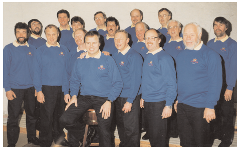
The Kingsmen in 1991

The chorus has over 52 singers from all parts of the South Devon area and performs regularly throughout the year in many locations. They have raised almost £100,000 for national and local charities since 1991.