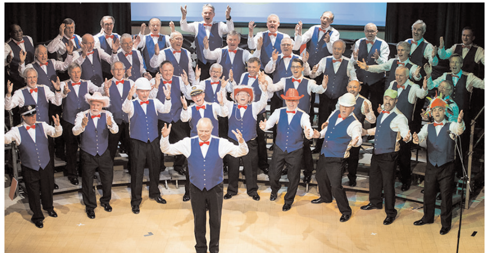
The Kingsmen performing at their 25th Anniversary Show 2016