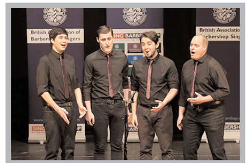
Borderline - 62.2%