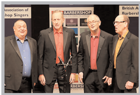
QM - 66.7%