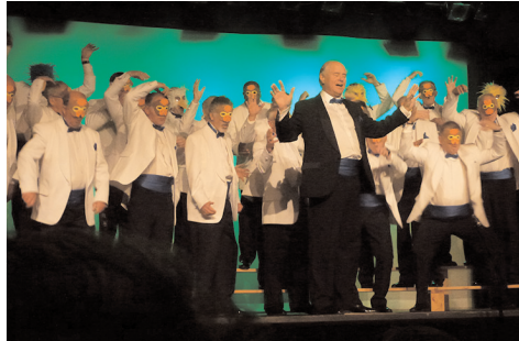
2015 Holland Tour with Friesian Harmonizers

Two trips to Holland were enjoyed in 2005 and 2015 when the chorus linked up with the Friesian Harmonizers and on two occasions have hosted them in Kingsbridge. They have also hosted Barbershop groups from New Zealand and the USA.