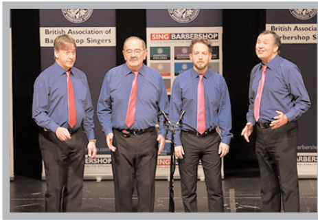
Half Eight - 66.8%