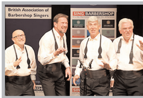
Cemetery Junction - 65.2%