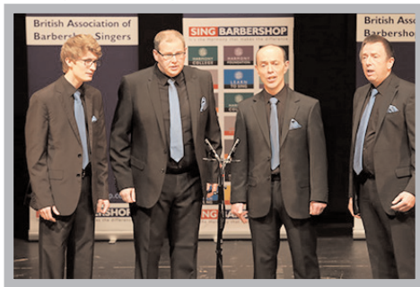
The Four Posters - 60.1%