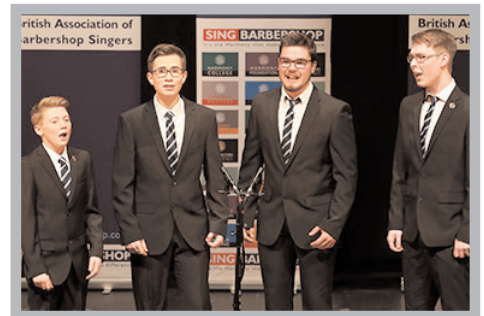
Diminished Fifth- 61.2%