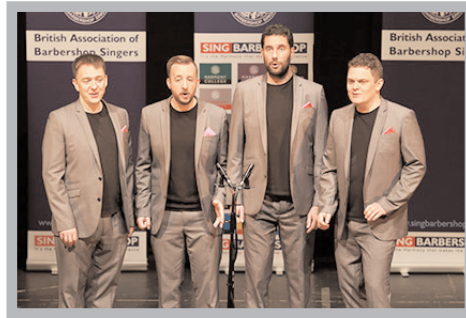
Open Road - 57.9%