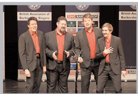
Thumbs Up - 61.7%