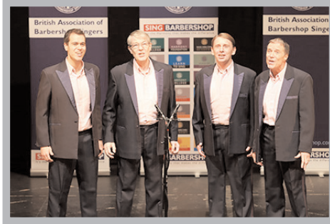
Platform I - 65.7%