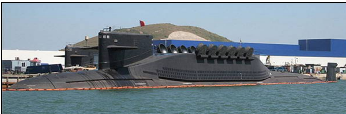
Figure 1. Jin (Type 094) Class Ballistic Missile Submarine