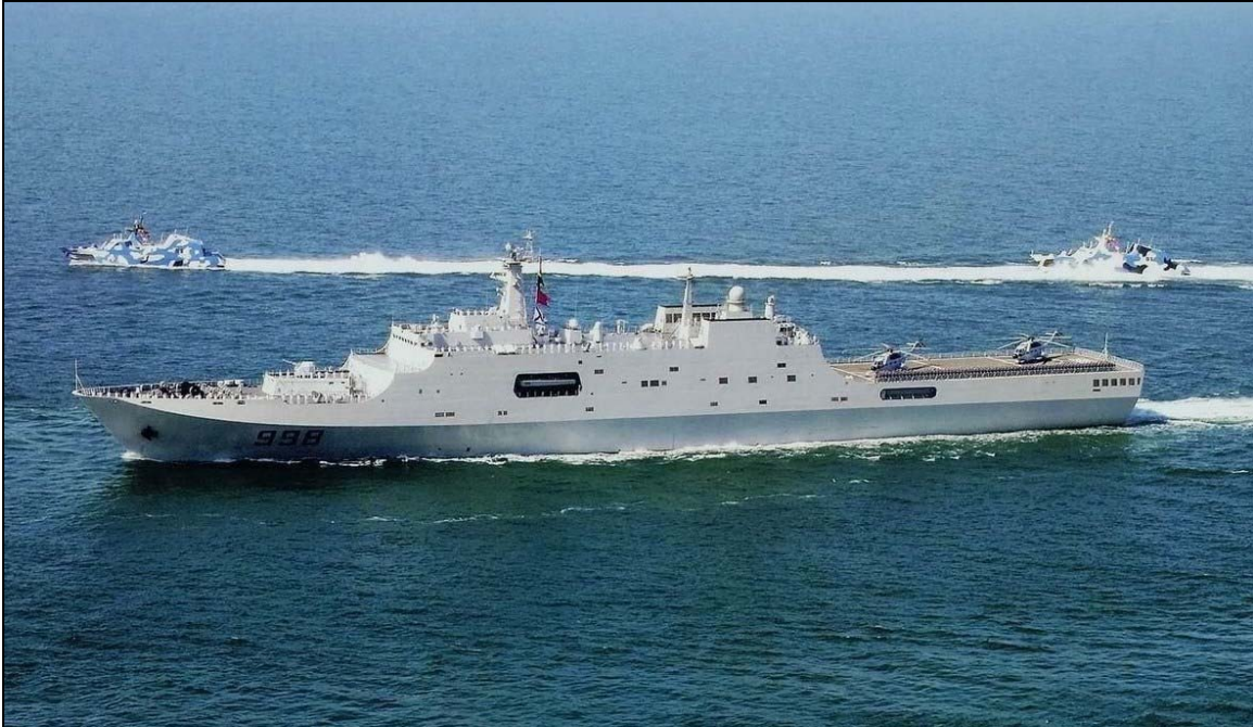
Figure 11. Yuzhao (Type 071) Class Amphibious Ship With two Houbei (Type 022) fast attack craft behind