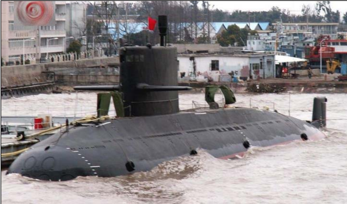
Figure 2. Yuan (Type 041) Class Attack Submarine