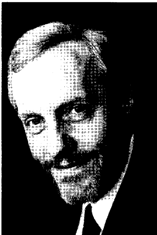
David F. Hendry

David Hendry was born of Scottish parents in Nottingham, England, on March 6, 1944. After an unpromising start in Glasgow schools, he obtained an M.A. in economics with first class honors from the University of Aberdeen in 1966. He then went to the London School of Economics and completed an M.Sc. (with distinction) in econometrics and mathematical economics in 1967 and a