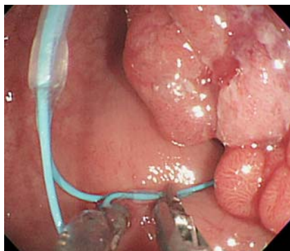
Fig. 3 Combining biopsy forceps to grasp the loop with scissor forceps to cut the loop.

A 58-year-old man was referred for resection of a pedunculated polyp, which had a head measuring 3.5×2.8cm and a stalk 1.5cm in diameter, over the sigmoid colon.