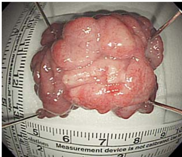
Fig. 4 The 3.5×2.8 cm pedunculated polyp which was successfully removed.