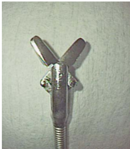
Fig. 2 Scissor forceps with flat blades.