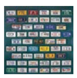
3 G Street Lobby

This glittering artwork holds many secrets. James Hampton created The Throne in a rented garage, and nobody knew it existed. Imagine opening a garage and finding this. What would you think? Describe what you found to a friend. Hampton invented his own secret code and wrote messages about this work of art. It is a secret language that cannot be cracked! Can you find the coded symbols within the artwork?