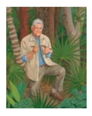
1 Twentieth-Century Americans, 1980-Present