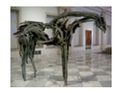
5 Lincoln Gallery / Contemporary Art

might you talk about? What is she eating?