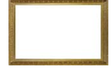
4 Recent Acquisitions

No. In fact, the National Portrait Gallery has portraits in many different media (the materials used to create an artwork). See if you can find a drawing, a photograph, or a sculpture. A great place to look is in the "Recent Acquisitions" exhibition near the G Street Lobby. Talk with the people in your group about the different media you find there, which one you like best, and why.