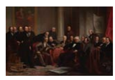
5 American Origins

Look at all the individuals in this portrait. Now, pick one and pose like the person in the painting. (If you are with a group, pick several and strike a pose together.) What does it feel like to stand or sit like the person in the portrait? What would