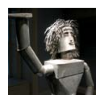
1 Folk Art

Welcome. Use this guide to explore amazing works of art that tell the story of America. Find each object in the galleries using the maps and images. Once you find an artwork, discover something about it by reading the notes and discussing the questions. Enjoy your visit.