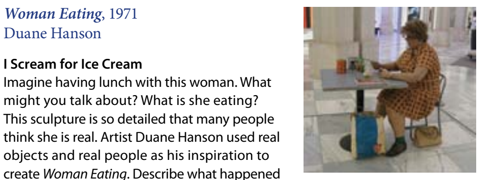
6 Lincoln Gallery / Contemporary Art