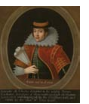
6 American Origins

it feel like to wear his clothes or be in the room with all those people? What do you think they are talking about? Read the label to find out who is in this portrait. If you were to create a portrait showing inventors from today, who would you include?