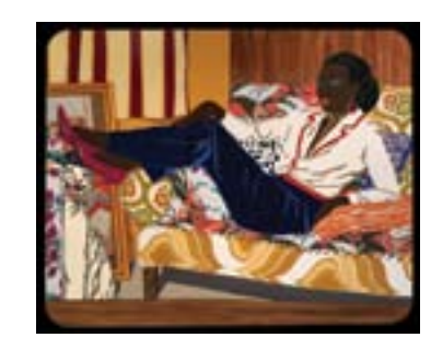
4 Lincoln Gallery/ Contemporary Art

From her ruby red shoes to her blue eye shadow, this lady sparkles. As an art student, Mickalene Thomas began experimenting with glitter to make her figures shine. In this painting, thousands of rhinestones create the dazzling surface. Look at the painting from different angles to see how the light dances over the surface and makes the painting twinkle.