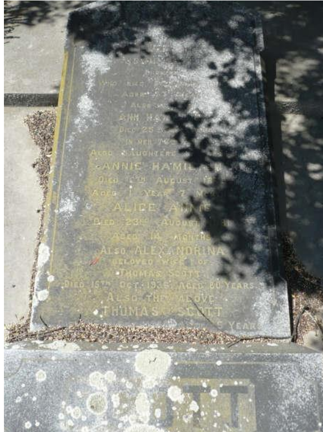
Scott Headstone Northern Cemetery, Dunedin