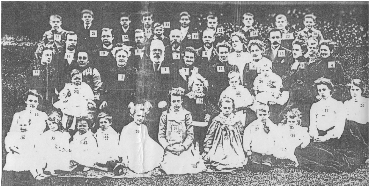
Golden Wedding Photograph 1903: