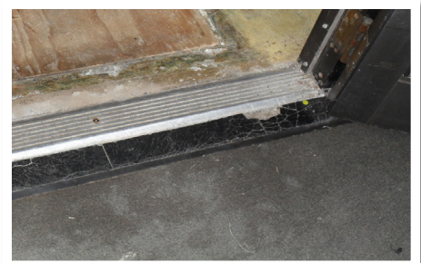
Neil Armstrong Door Threshold [Energy Conservation]