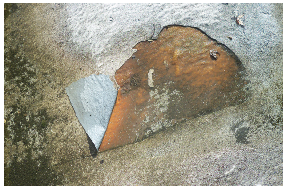
Urethane coating roof deterioration [Roof Repair]