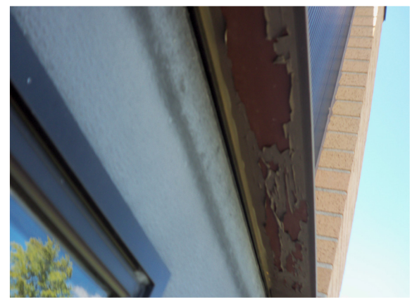
Window header frame deterioration [Energy Consumption]