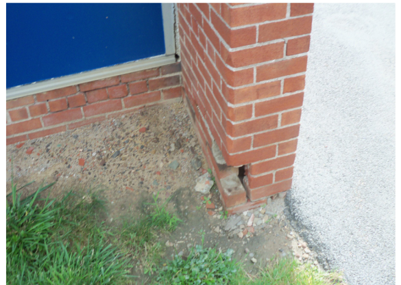
Brick deterioration/mortar joint repair, brick pointing [Structural]

The goal of Phase X is to support that effort with no tax increase for our tax payers.