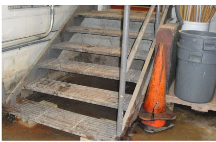
Florence Brassler School Stairway replacement [Structural]

Below are photos to represent the type of repairs that will be made as part of the Phase X Capital Project. All repairs are not represented.