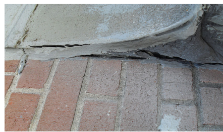
High School Exterior Wall [Roofing]