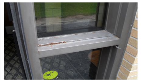
Walt Disney Door Panel [Energy Conservation]