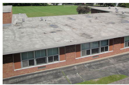
Florence Brassler Roof [Roofing]