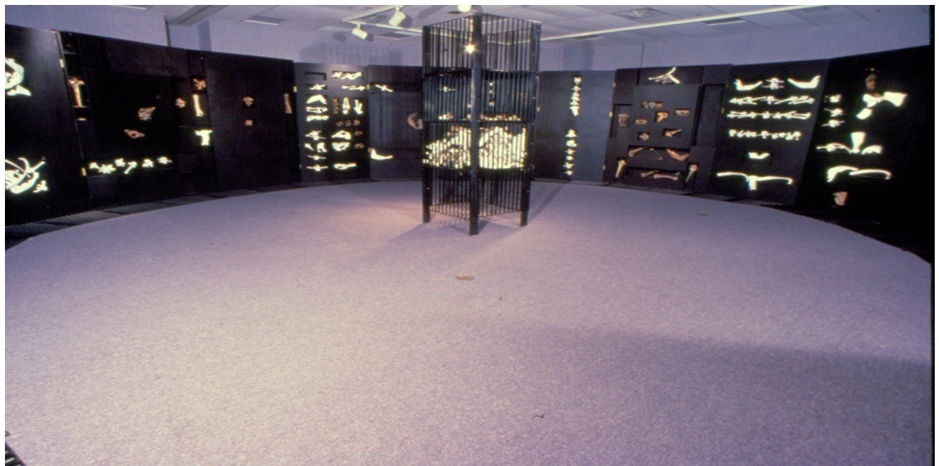
Axis mundi -site specific installation W.H Over State Museum South Dakota - 35 panels with buffalo bones