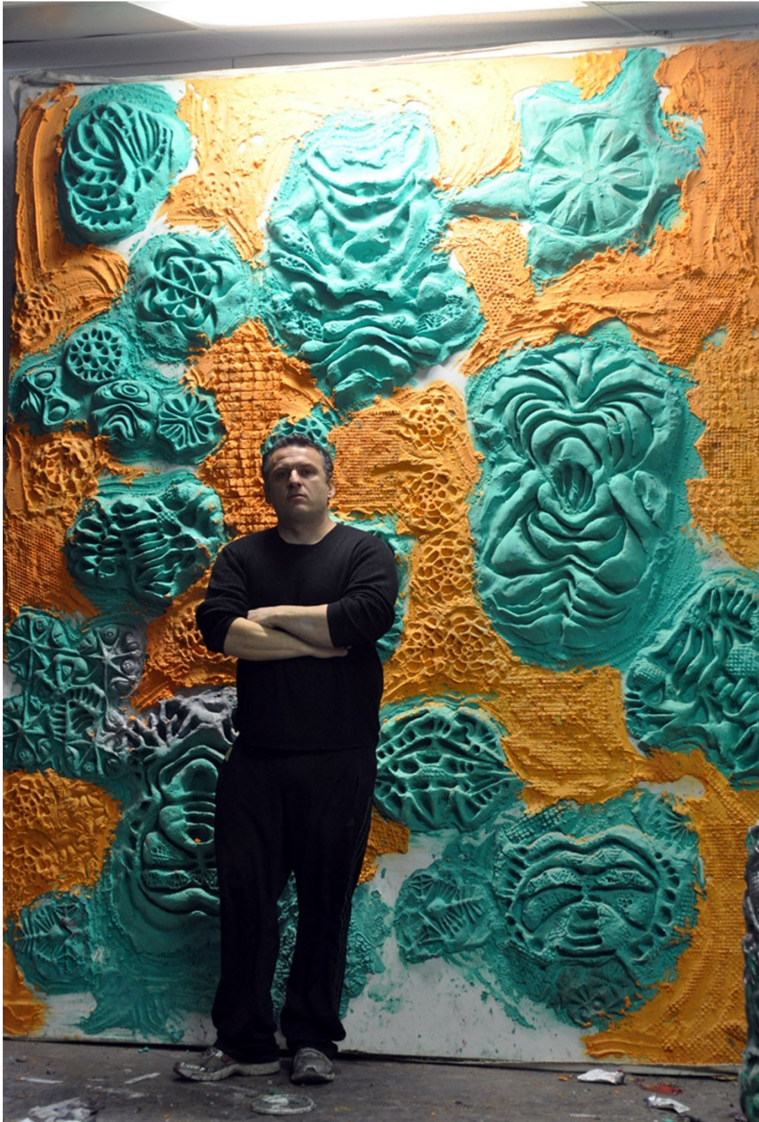
Nanoshapes - 3-D paintings- March -2013 studio scale detail image - medium pigment resin fused on canvas 120" X 96" X 6"