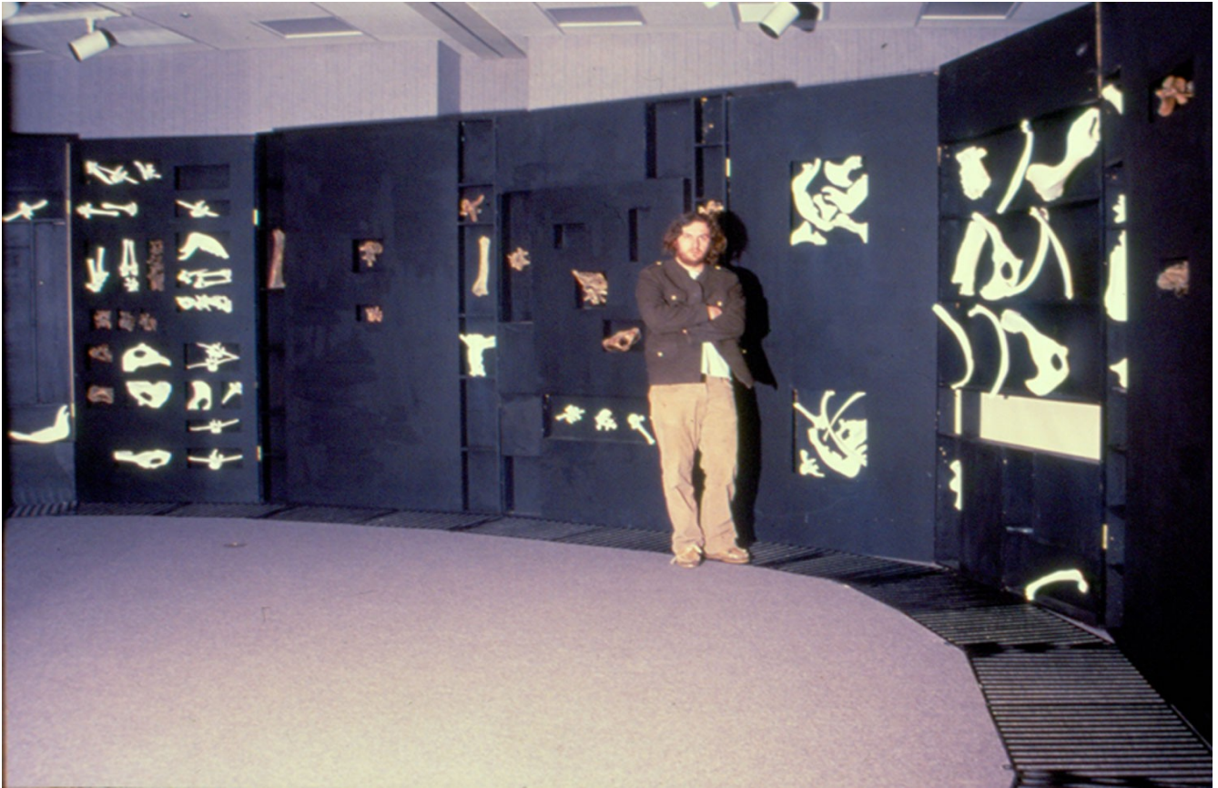
Axis mundi -site specific installation W.H Over State Museum South Dakota - 35 panels with buffalo bones