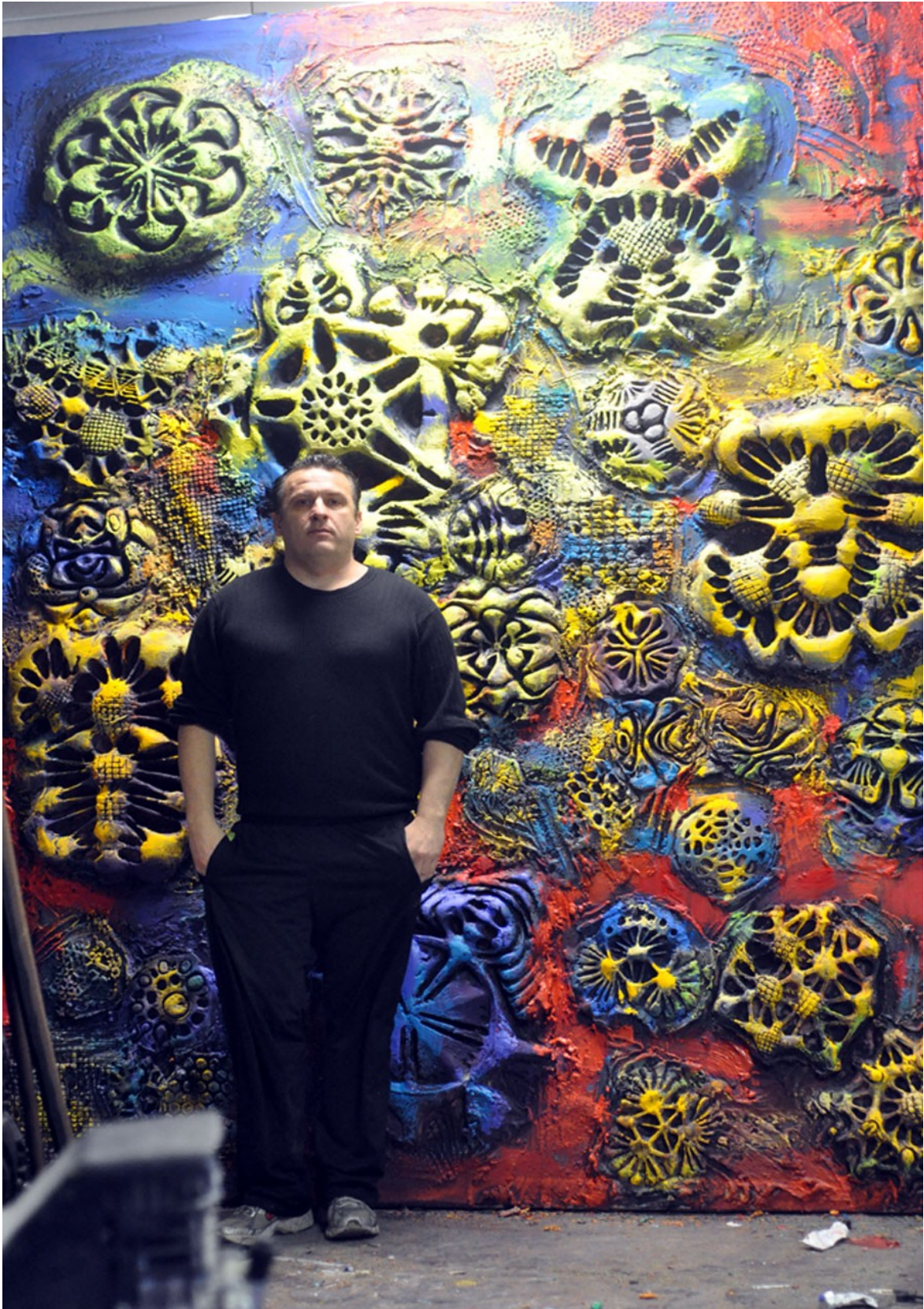
Nanoshapes - 3-D paintings- March -2013 studio scale detail image - medium pigment resin fused on canvas 120" X 96" X 6"