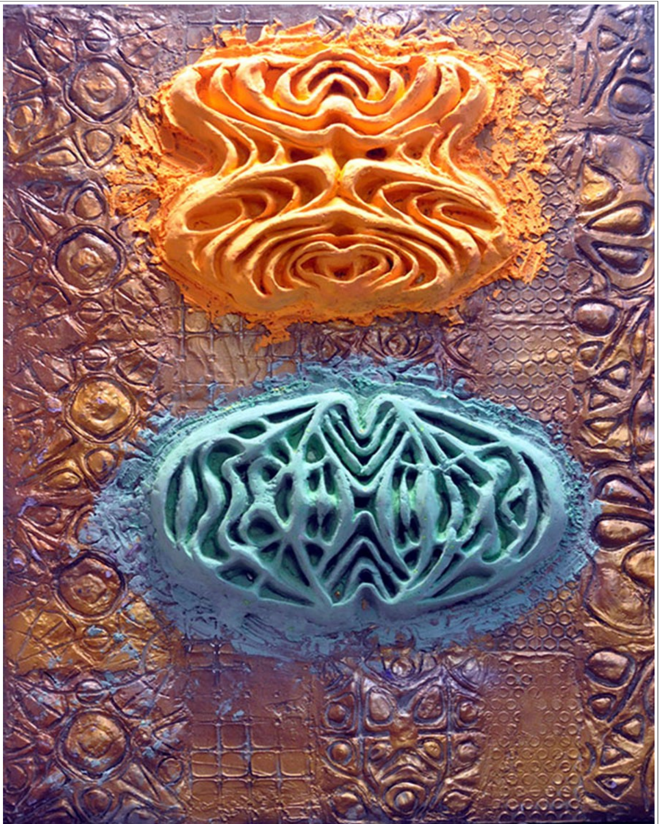
Quest for Earthly Paradise-medium-pigment resin 3D shapes fused on canvas 203 cm X 140cm X 12 cm