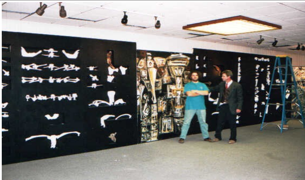
Imago Mundi - Bede Art Gallery, Mount Marty College. Yankton, South Dakota