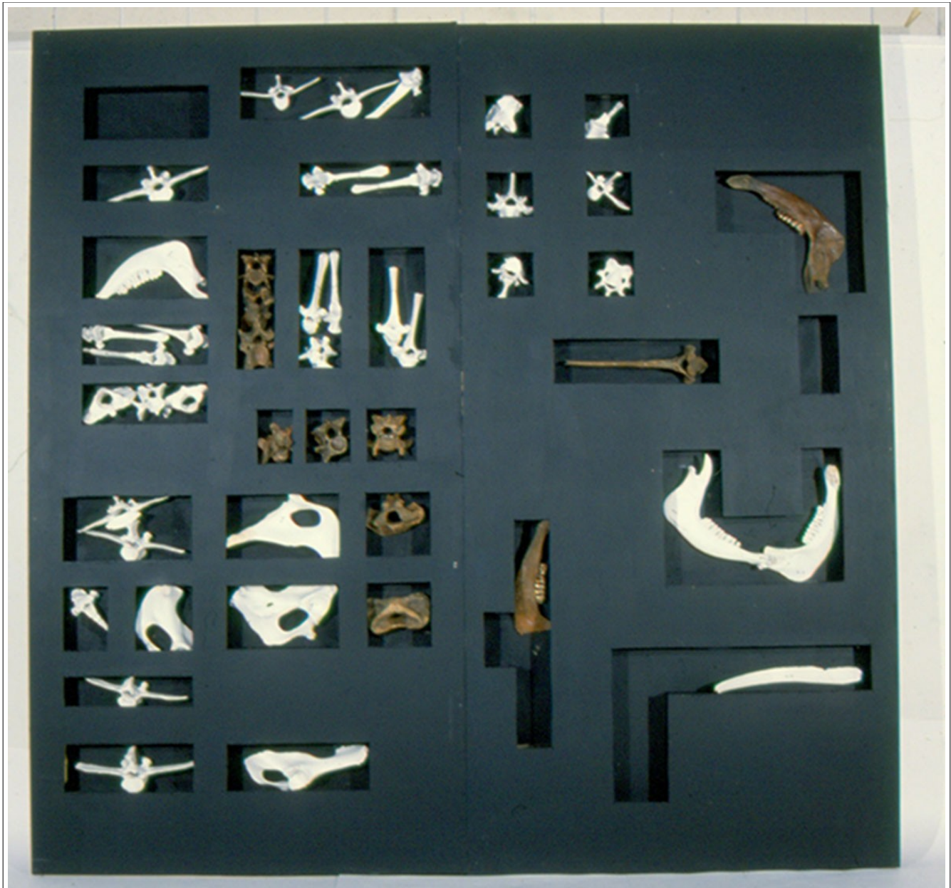
Bones -buffalo bones on panel - 240 cm X 240 cm X 12 cm