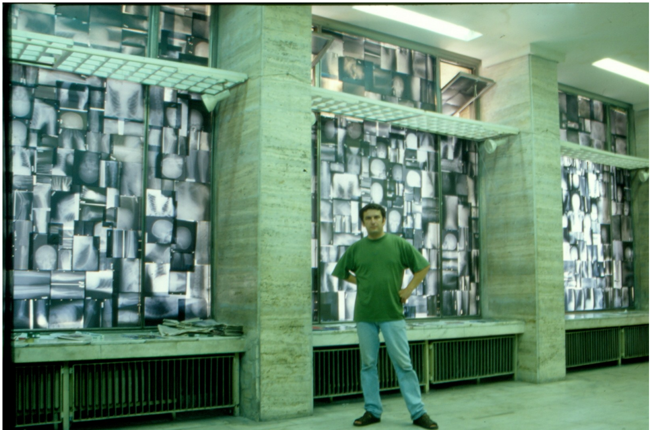
Osuaria- site specific installation 1000 x ray + painted animal bones Atelier 35 Bucharest Romania