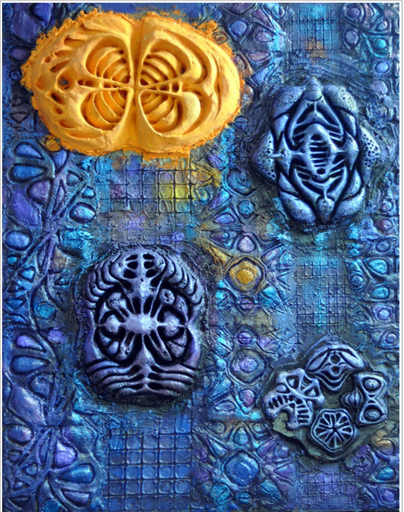
The Promise Land-2012 -medium-pigment resin 3D shapes fused on canvas 203 cm X 152cm X12cm