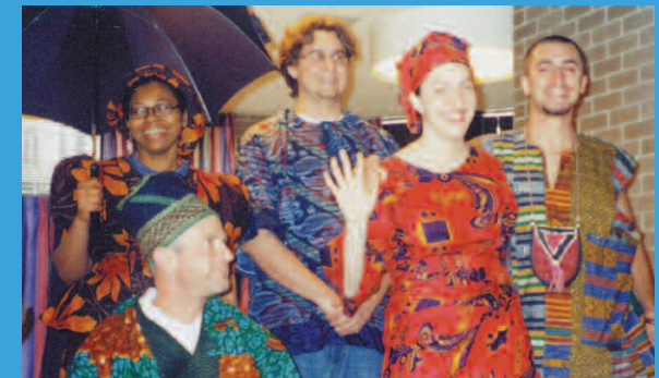
Yoruba students participate in a skit