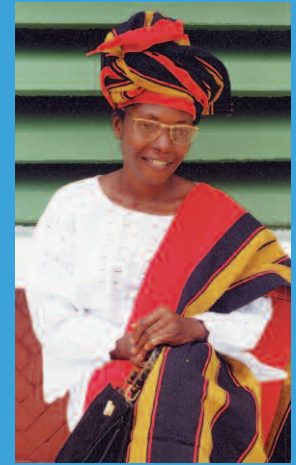
A woman in Yoruba attire.