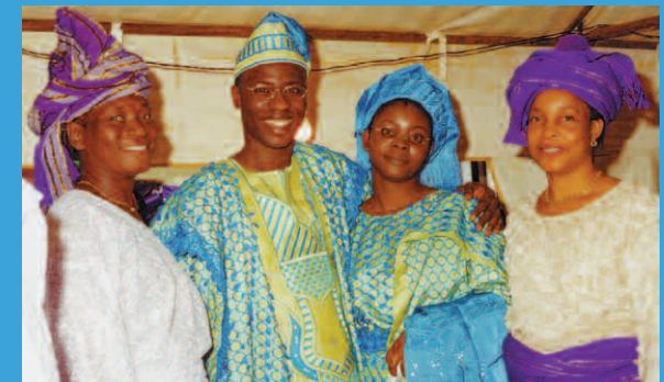
Guests flank the bride and groom at a traditional Yoruba wedding in Nigeria