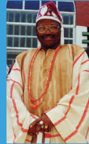
A traditional Yoruba Oba (king)

Today, however, a Yoruba will often call himself or herself “Ib`ada`n” or “I`j`e.bu” rather than Yoruba in order to emphasize his or her local identity. There are more than fifty traditional Yoruba city-states recognized today. Though their domains have been absorbed into the government of the modern nation of Nigeria, traditional kings often have considerable local and national political power.