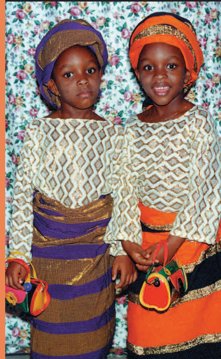
TWIN GIRLS IN YORUBA ATTIRE

701 Eigenmann Hall, 1900 East 10th Street Bloomington, IN 47406 USA Telephone: (812) 856-4199, Fax: 8128564189 Email: nalrc@indiana.edu Website: http://www.nalrc.indiana.edu