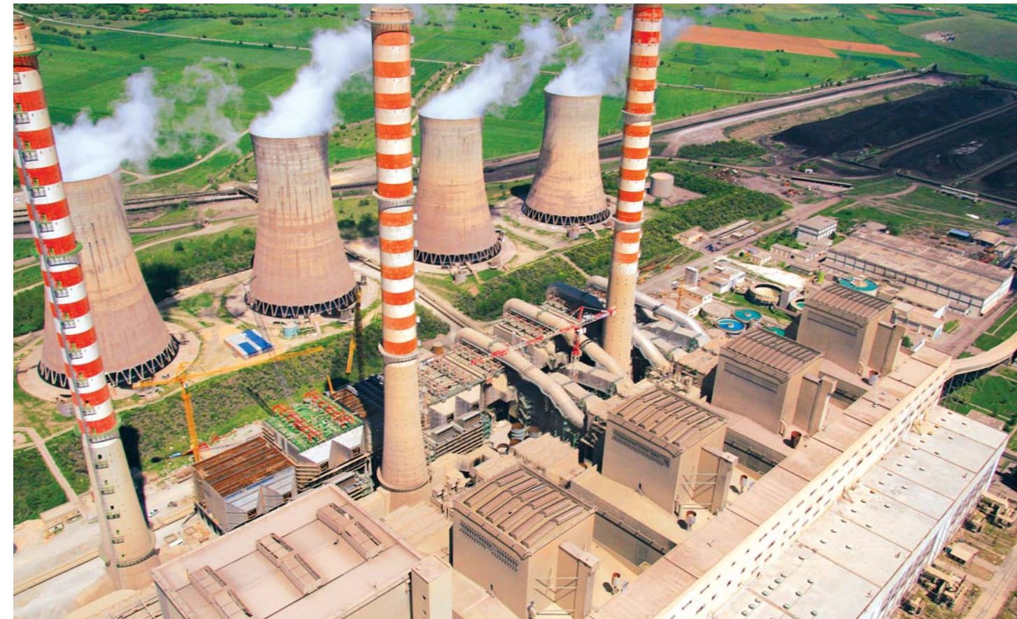
Upgrading of the Electrostatic Precipitators for Agios Dimitrios Units I, II, III and IV