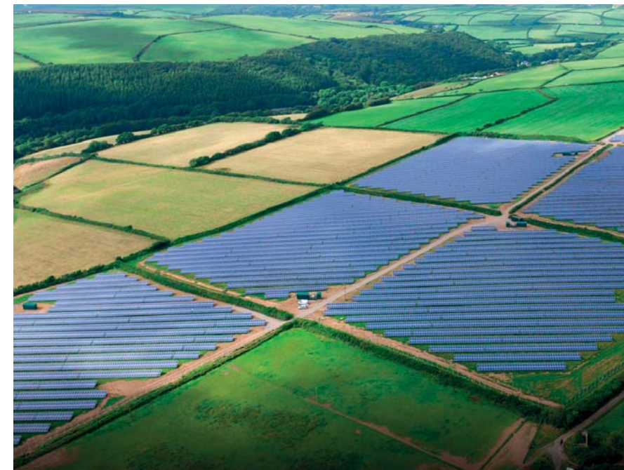
METKA EGN solar PV plant in the UK

METKA recognizes the global challenge of climate change and the critical importance of renewable energy sources – such as the sun, wind, water and biomass – for sustainable development. We strongly support the adoption of low carbon technologies and we are committed to continuous development of our capabilities in this area.