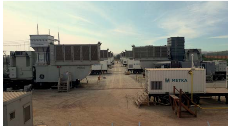
Mobile gas turbine power generating sets installed in Ghana

METKA has successfully carried out several projects to provide fast-track simple cycle power generation capacity, with particular experience with aeroderivative type gas turbines.