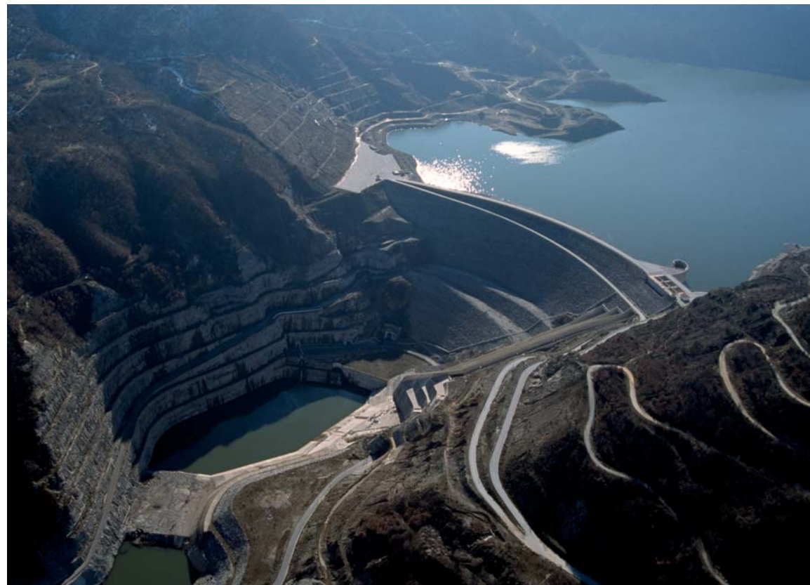
The Thissavros pumped storage hydro plant (3x100 MW) in Northern Greece

METKA recognizes the global challenge of climate change and the critical importance of renewable energy sources – such as the sun, wind, water and biomass – for sustainable development. We strongly support the adoption of low carbon technologies and we are committed to continuous development of our capabilities in this area.