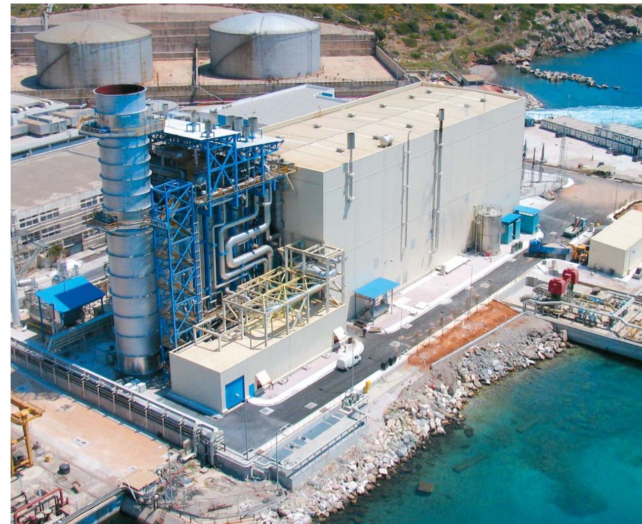
PPC Lavrio Unit V - 378 MW combined cycle power plant completed in 2006

METKA has significant expertise in gas turbine based power plants, with a broad range of experience in combined cycle, co-generation and simple cycle projects. We provide our customers with highly competitive combined cycle plants with world-class performance.