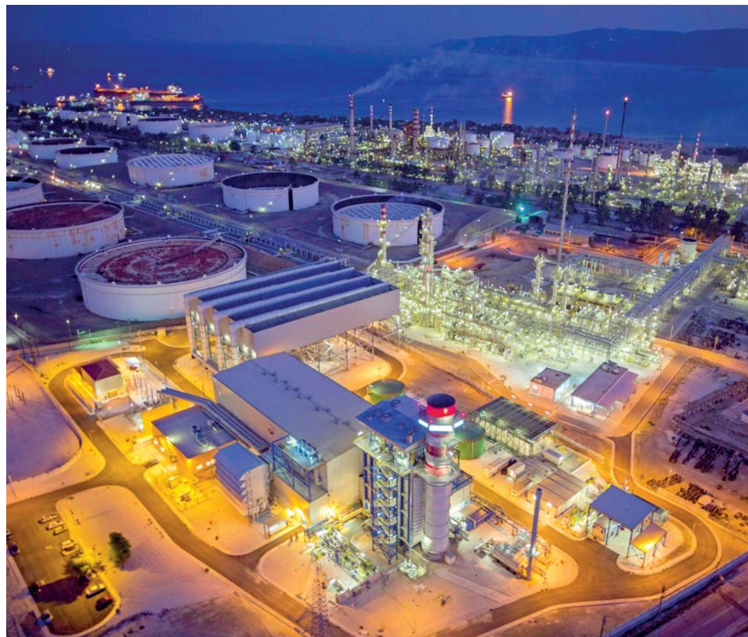
Korinthos Power 437 MW, combined cycle power plant, constructed by METKA at the Motor Oil Korinthos Refinery complex in Greece.

Our objective is to provide the optimum solution for client requirements and project needs.