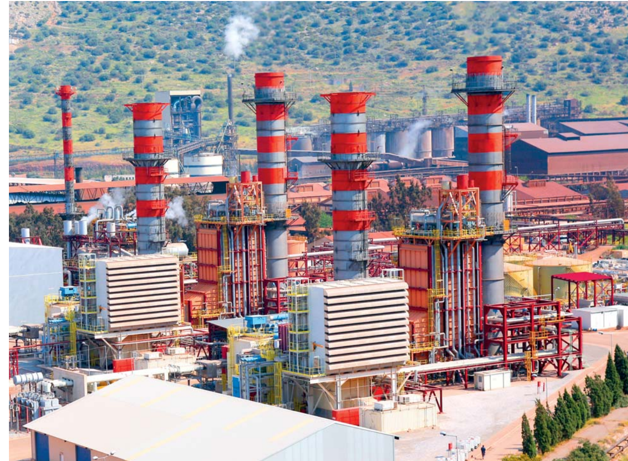
The 320 MW Aluminium of Greece co-generation plant. The plant delivers power to the network and process steam to the alumina plant, which can be seen in the background.