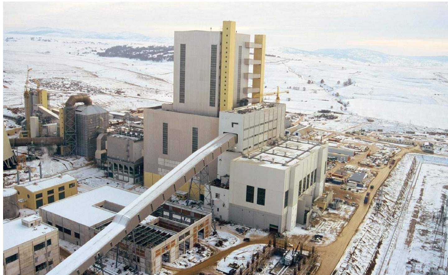
Florina 330 MW lignite fired power plant

METKA has consistently delivered complex and demanding projects to the highest technological standards.