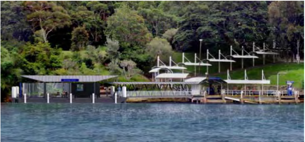
Plate 9: Looking north toward the existing Huntleys Point Wharf with an artists' impression of the new wharf post construction