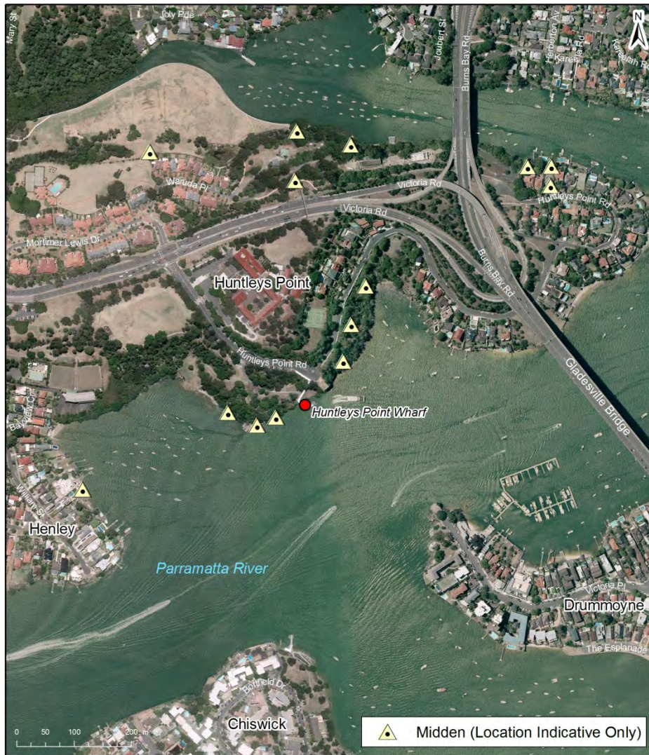
Figure 3: Previously recorded Aboriginal Midden sites at Huntleys Point