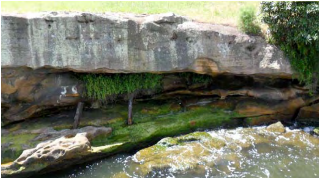
Plate 1: Aboriginal Rock Shelter (AHIMS#45-6-1948/1826) to the east of the existing Huntleys Point Wharf, the site also demonstrates remnant European heritage in the form of metal stanchions from the previous wharf. These are associated with the adjacent locally listed 'Wharf Site and Steps'