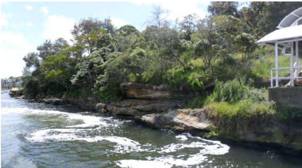
Plate 2: Aboriginal Rock Shelter (AHIMS#45-6-1931) to the west of the existing Huntleys Point Commuter Wharf. The current walkway can be seen to the far right of the image shelter