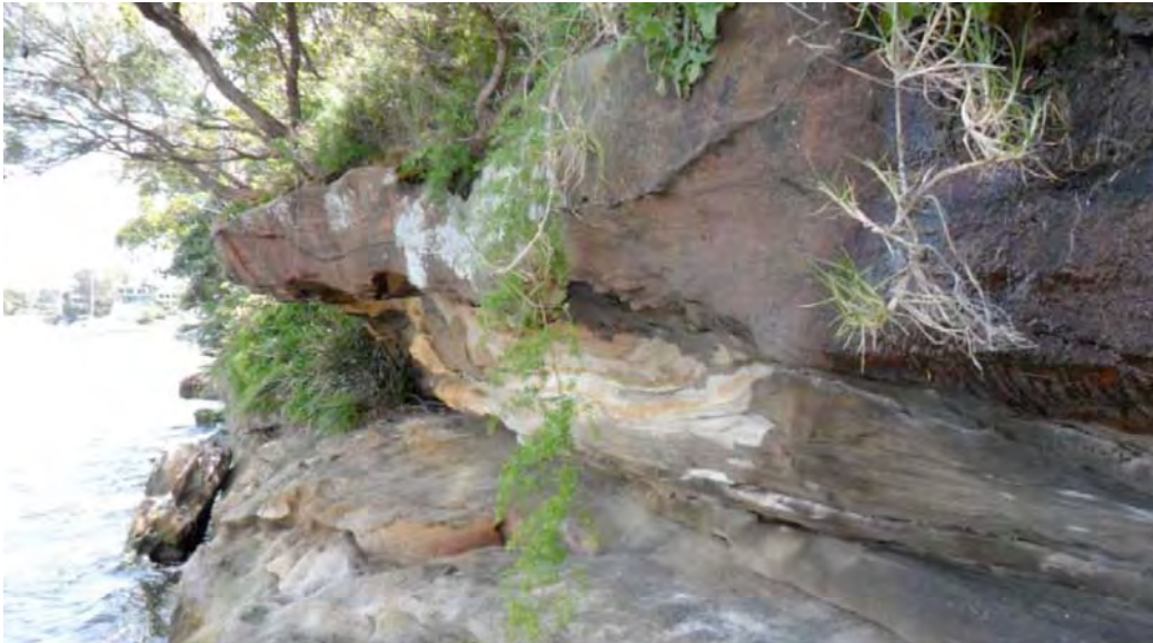
Plate 3: Aboriginal Rock Shelter (AHIMS#45-6-1931) to the west of the existing Huntleys Point Wharf