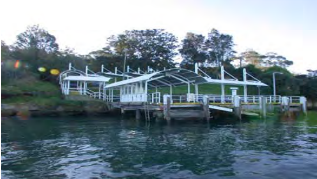
Plate 7: Looking north east across the existing Huntleys Point Wharf toward shore. This existing structure will remain intact