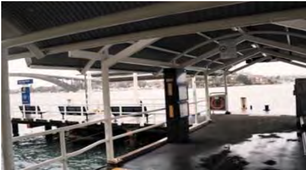
Plate 8: Looking south within the existing Huntleys Point Wharf toward shore. This existing structure will remain intact