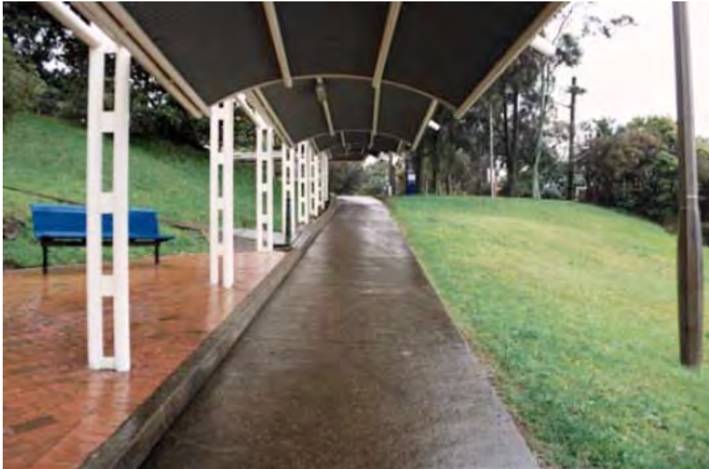
Plate 5: Looking east north east across the sheltered walkway leading to existing Huntleys Point Wharf