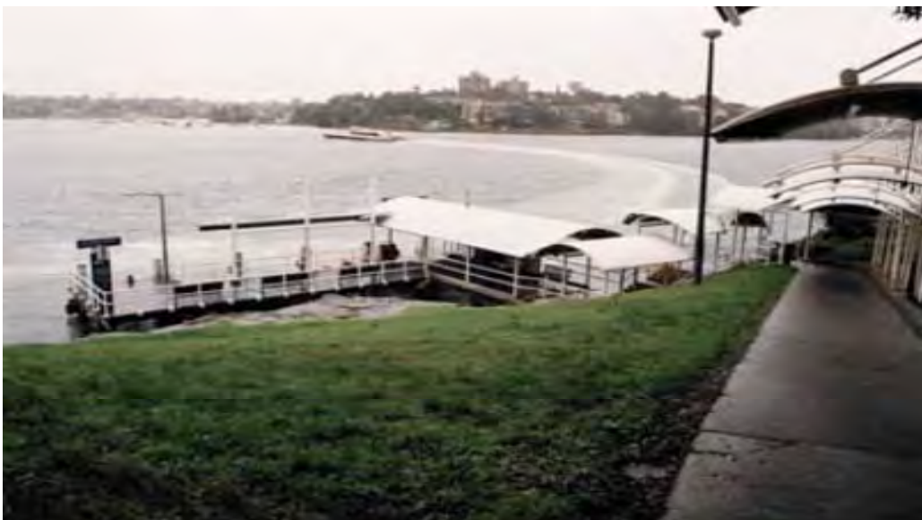
Plate 6: Looking south west across the existing Huntleys Point Wharf to the Parramatta River