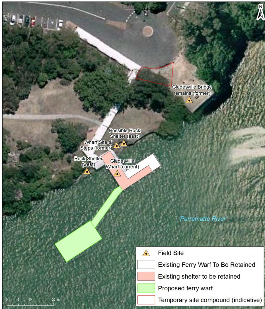
Figure 2: Proposed new Huntleys Point Commuter Wharf