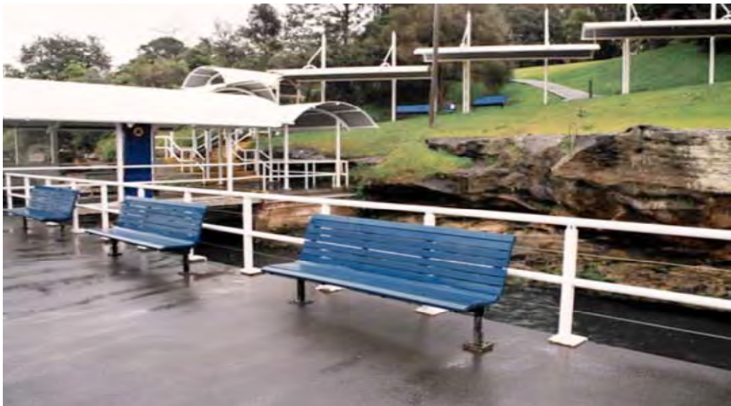
Plate 4: Looking north west across the existing Huntleys Point Wharf toward shore. The heritage listed 'Wharf Site and Steps' can be seen to the immediate east/right of the Wharf structure as it adjoins shore, and the Rock Shelter can be seen to the east of the 'Wharf Site and Steps'