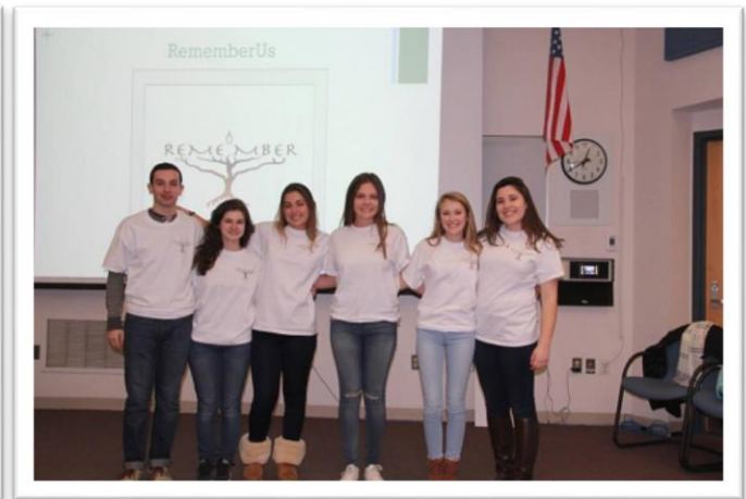
Volunteers – Boston-area Social Media Team, RememberUs.org

It is very important to pass the knowledge from one generation to another. Maintaining awareness about the tragic events of Holocaust is important not only for Jews, but for all the people.