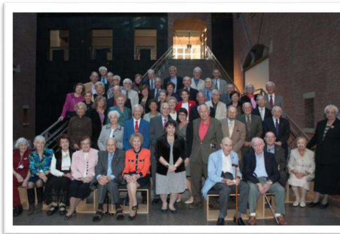
Volunteers – US Holocaust Memorial Museum, Washington, DC