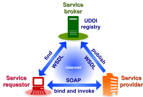
Fig. 1. Service-oriented architecture.