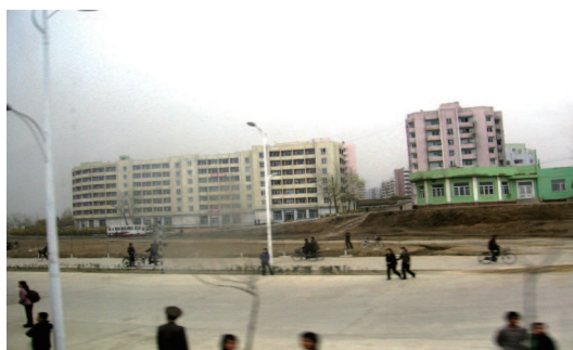
Figure Sinuiju-VI. Nam-Sinuiju 2006