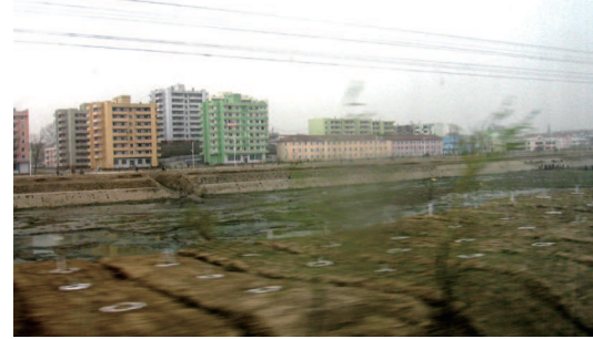
Figure Sinuiju-XIII. Sinuiju (2012)