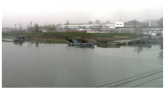
Figure Sinuiju-III. Rakwŏn Machine Complex (view from Samgyo-chŏn) (2012)

In the Factory 9<sup>th</sup> August (Sinuiju Mining Machine Factory), which is located in the Ryŏngsang-dong district, mining machines of all kinds (high-speed excavators, rotation excavators, loaders, drills and wagons) are produced. 3,000 employees<sup>21</sup> work on an area of 143,000 m<sup>2</sup>.