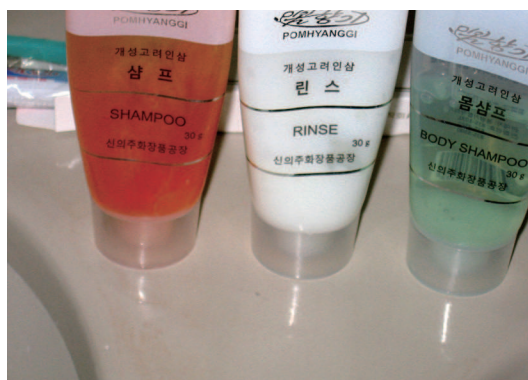
Figure Sinuiju-V. Pomhyanggi-Products from Sinujiu from a Hotel in Wonsan (2012)

In the Sinuiju Shoes Factory mainly boots, which are sold in the whole province of Phyongbuk, are produced.