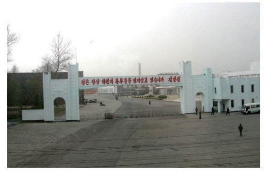
Figure Sinuiju-II. Rakwŏn Machine Complex (2012)