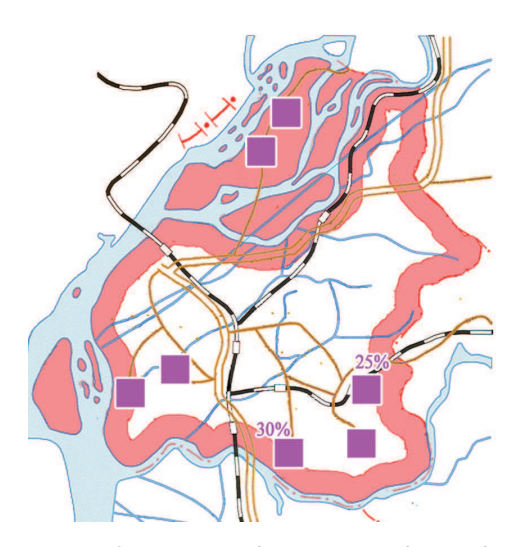
Figure Sinuiju-I. Agricultural land in the ri

96.7% of the city area consists of elevations at an altitude of 100 m, 3% at an altitude