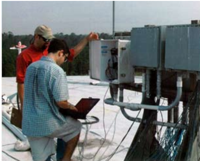
In-situ instrumentation techniques were employed for the NRRL bioreactor. Data collected from the sensors were analyzed to measure the performance of the bioreactor.

The overall temperature of the waste inside the landfill increased in areas where a significant amount of air was added. Temperature in the shallow layer was readily affected by air injection of adjacent injection wells. Rapid temperature rises halted air addition due to the risk of sub-surface fires. Field trials of air addition at NRRL indicated that it was very difficult to control temperature by changing the rate of air addition. The results from NRRL also indicated that it was