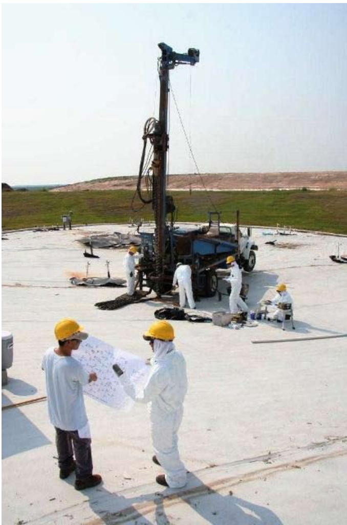
Performance of the bioreactor operation was verified by drilling and sampling landfilled waste. The samples were collected from different areas and depths and were examined for moisture content and degree of biodegradation.

Leachate quality using simulated bioreactor lysimeters show rapid degradation of biodegradable pollutants in leachate, particularly by operating aerobic bioreactors. Leachate quality was determined by measuring water quality parameters such as pH, chemical oxygen demand (COD), biochemical oxygen demand (BOD), total organic carbon (TOC), ions, and metals. Leachate quality varied with time and by conditions (aerobic and anaerobic). For example, ammonia concentration increased over time in the anaerobic lysimeters but did not increase in the aerobic lysimeters. Similar results