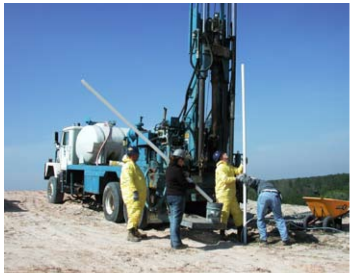
Vertical wells were drilled at the New River bioreactor. Small diameter pipes (PVC; 2 inches in diameter) were placed into holes constructed with an open-flight rotary auger (4.5 inches in diameter).