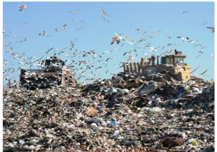
Landfilling Municipal solid waste (MSW) in an active cell at New River Regional Landfill

While the solid waste management profession has recognized the strong potential benefits offered by bioreactor landfill operation compared to conventional dry tomb landfilling, wide-scale bioreactor implementation has been limited by a lack of standardized design and operational procedures and guidelines. The Florida Bioreactor Demonstration Project approached this problem by working with several landfill operators in Florida to implement the technology so that researchers from the State University System could gather critical data at full-scale operating levels and provide needed guidance for future implementation.