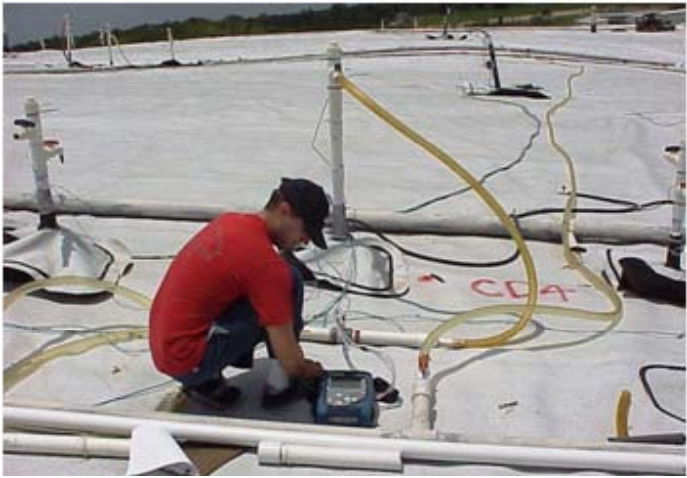
During the air injection experiment, temperature of landfilled waste and air flow rate per well were monitored. If the temperature approached a limit, air flow rate was reduced.

Total earth pressure cells demonstrated incremental pressure increase as a result of lift placement, which was expected. Overburdened pressure measured was found to be on an average, 50% less than the calculated overburdened pressure based on waste height and density. This was attributed to factors such as arching, susceptibility to point loads, and possible pressure cell