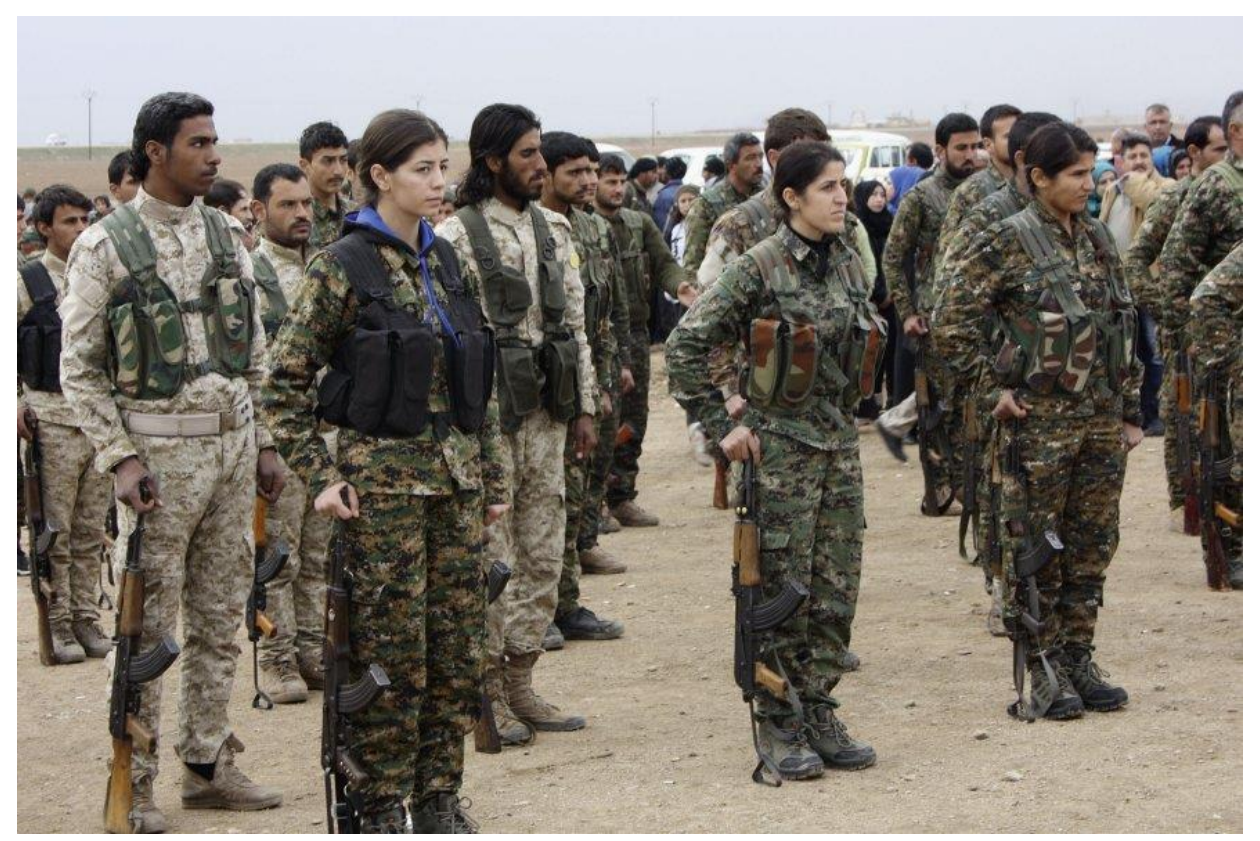
Sanadid, YPG, and YPJ fighters at the funeral in Ja'ada of three Sanadid members killed fighting the Islamic State. The 30-40,000 fighters of the Kurdish YPG and YPJ constitute the large majority of this force. (Jonathan Spyer)