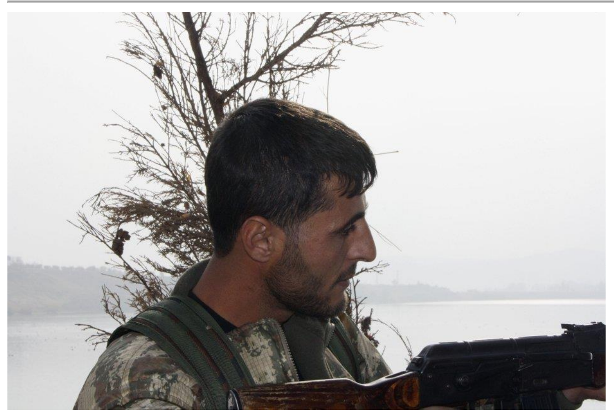
A fighter of the Shams al-Shamal militia at a front line position at Ja'ada, on the east bank of the Euphrates. (Jonathan Spyer)