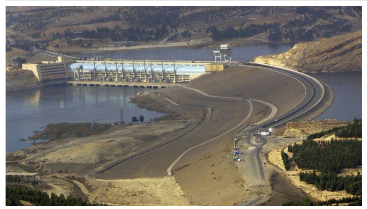
The strategically key dam of Tishreen on the Euphrates river in Syria. The SDF crossed the dam in early 2016 but has not yet pushed west of the river.