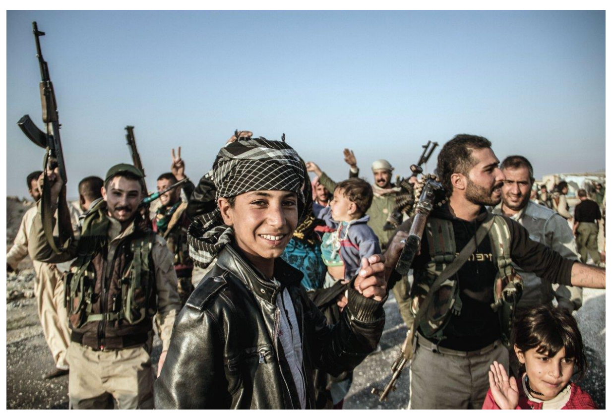
A local teenager celebrates with fighters after his village was liberated on 8 November from the Islamic State. The SDF framework solidifies the limited US-Kurdish partnership against the Islamic State in Syria.

However, the Western coalition's relationship to this initiative is not clear. It has largely been ignored in media coverage of the Syria conflict, yet if armed groups associated with the initiative are to play a crucial role in challenging the Islamic State in northern Syria, then the political - and not solely military - nature of the initiative will be important. The political ambitions of Syria's Kurds, and the more limited ambitions of the Western coalition regarding the SDF, may be a cause for tension in coming months.