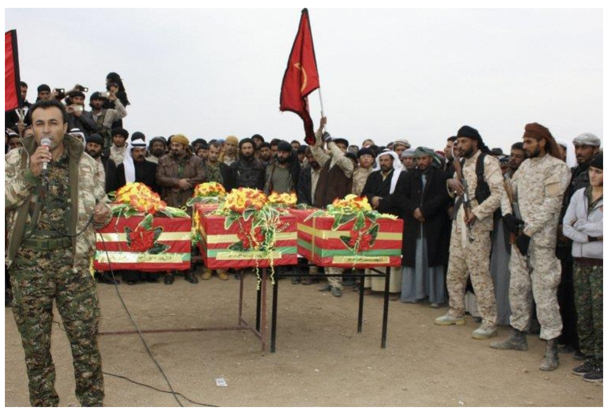
A YPG commander speaks on 18 December at the funeral of three fighters of the Sanadid militia. The YPG is one of the most powerful military forces in northern Syria.

with a number of YPG fighters telling IHS Jane's privately that they did not regard the movement as a partner. Indeed, a YPG attack on a Thuwar Raqqa checkpoint took place in early December 2015, for which the YPG later apologised.