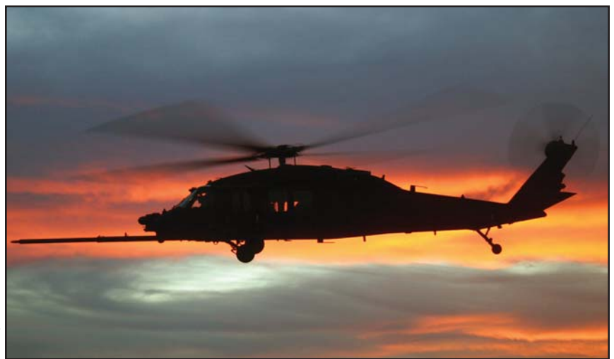
A MH-60 from the 160th Special Operations Aviation Regiment (Airborne) conducting operations over Iraq.

In support of European Command, SOF deployed to Africa numerous times in 2006 in support of Operation Enduring Freedom Trans Sahara (OEF-TS) and the Trans Sahara Counterterrorism Initiative. Leveraging an indirect approach, SOF employed a wide range of joint elements to all nine OEF-TS partner nations. The focus was to provide training and assistance to the host countries to develop their indigenous capacity to combat terrorism and create a more secure and stable environment. A highlight for OEF-TS in 2006 was the deployment to Chad of two Foreign Military Training Units (FMTU) from the Marine Corps Forces Special Operations Command (MARSOC). For six weeks, the FMTUs formed, trained, equipped, and assessed a battalion from the Chadian anti-terrorism regiment on a broad range of individual and unit skills, to include officer tactical planning and leadership courses. The trained anti-terrorism battalion is now capable of