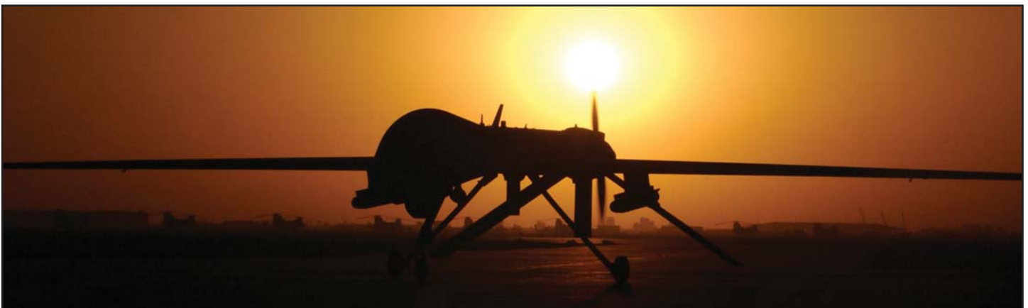
The RQ-1 Predator taxis in after one of its sorties at sunset.

Two new Program Executive Offices (PEO) complete a transformation and vision for the future of USSOCOM's acquisition structure and methodology. The PEO for SOF Warrior manages the development, acquisition and sustainment of systems specifically designed to enhance the capabilities of the SOF Warrior as an integrated system. This includes force protection equipment, individual weapons, ammunition, demolitions, individual clothing and personal equipment, night vision and electro optics, and ground mobility systems. The PEO for Mission Training and Preparation Systems (PEO-MTPS) is the other new