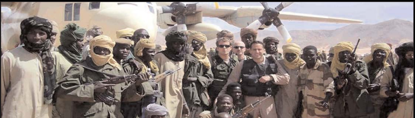
Air Force Special Operations Command advisors pose with members from the Chadian Air Force.