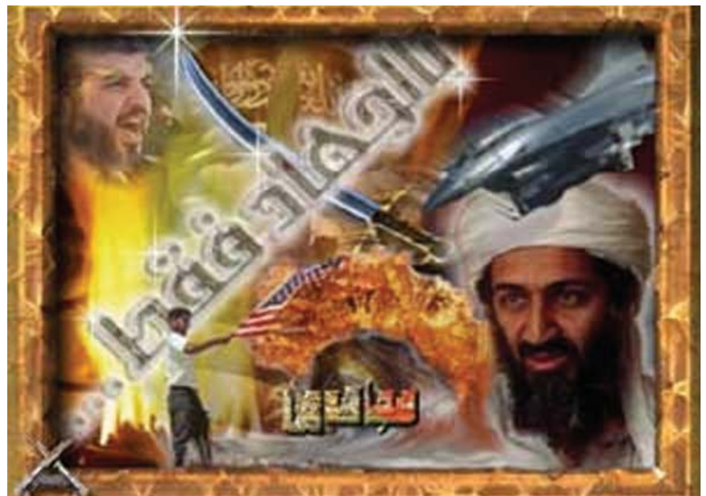
An al-Qaida website image claiming responsibility for attacks in Kenya and the United States.

For militant Islamic terrorists, there can be no peaceful coexistence with those who do not subscribe to their world view. There will be no compromise and no consideration of conflicting viewpoints – creating the need for our resolve and commitment in the long war.