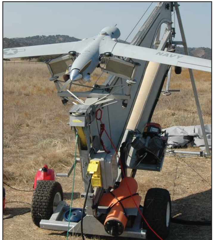
A Scan Eagle unmanned aerial vehicle sits on a launch sled during USSOCOM sponsored Tactical Network Topography 07-1 experiment at Camp Roberts, Calif.

The Special Operations Special Technology (SOST) program demonstrates and evaluates emerging and advanced technologies in relevant SOF environments. SOST projects are oriented towards the development of more mature technologies and prototypes to mitigate or eliminate capability gaps. Efforts are focused on a