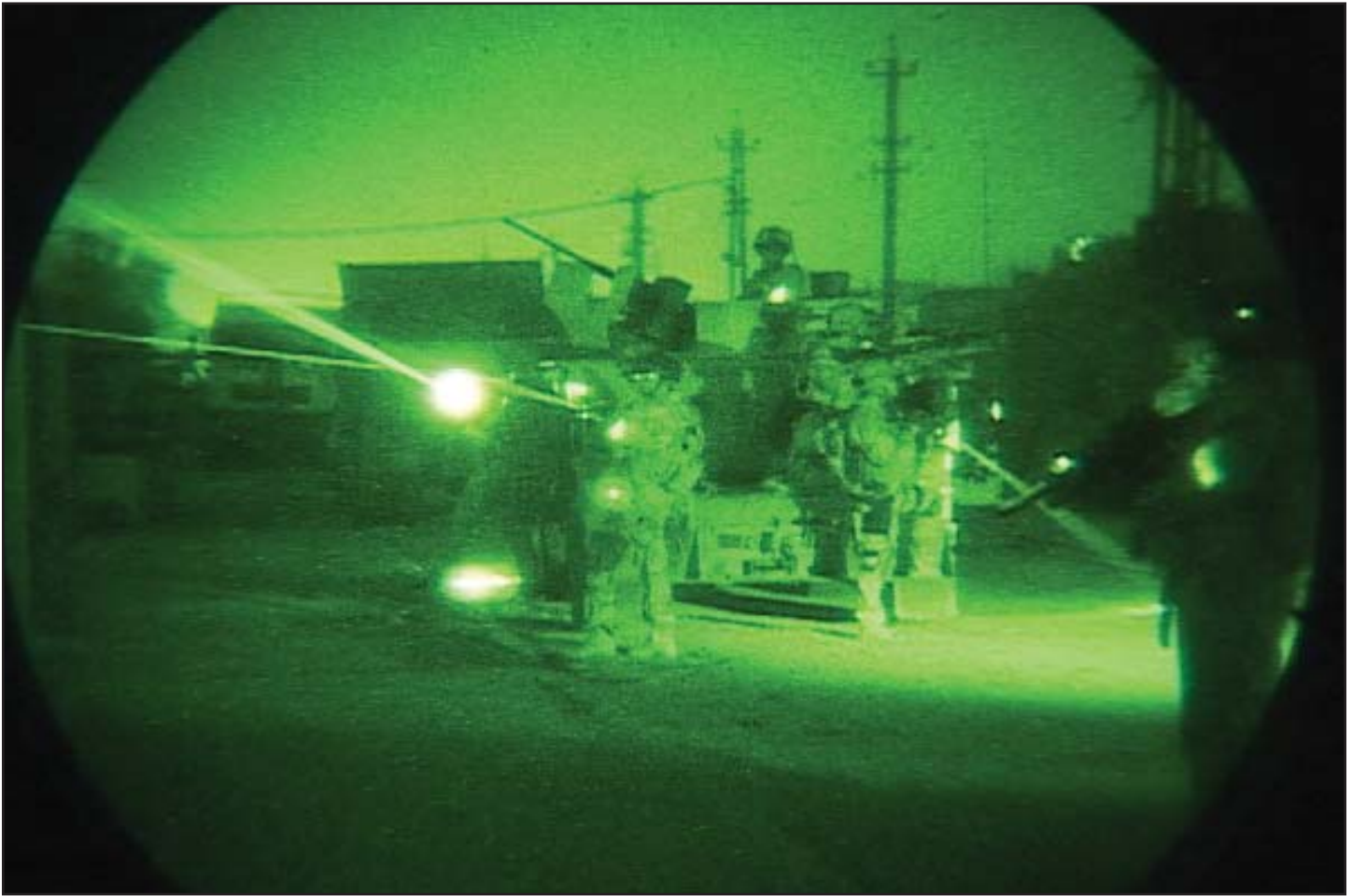
Special Forces conduct a night-time operation in Iraq.

At the heart of the CCSO are three strategic objectives for the future that USSOCOM will continue to pursue: GWOT Lead, Global Presence, and Global Expeditionary Force. The document establishes five key capability areas that are essential to achieve the three strategic objectives.