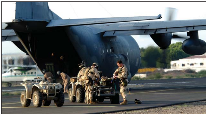
SOF personnel prepare a simulated patient to be loaded onto a MC-130 aircraft during a rescue exercise on Camp LeMonier, Djibouti.

Overall, USSOCOM continues to modernize and extend the service life of the rotary wing fleets with a focus on survivability modifications to protect SOF aircraft and crews. Examples include the Joint Terrain Following/Terrain Avoidance Radar, a suite of infrared countermeasures, the MH-60L Blackhawk modernization programs, and the procurement of seventy-two new, highly modified MH-60M aircraft.