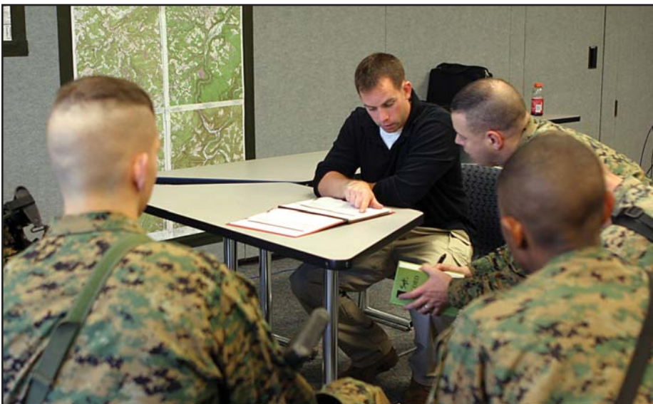
Marine Corps Forces Special Operations Command Marines participate in linguistic training.

For example, the Joint Special Operations Warrior Certificate is already underway, which defines and prioritizes the competencies that SOF mid-level grades should have to focus on the operational level of warfare. This certificate program focuses on current missions, joint doctrine, SOF capabilities, interoperability, planning, and similar operational issues facing the joint SOF operator and SOF enabler. A USSOCOM Staff Operations certificate to prepare non-SOF personnel to operate as effective members of the various SOF command staffs