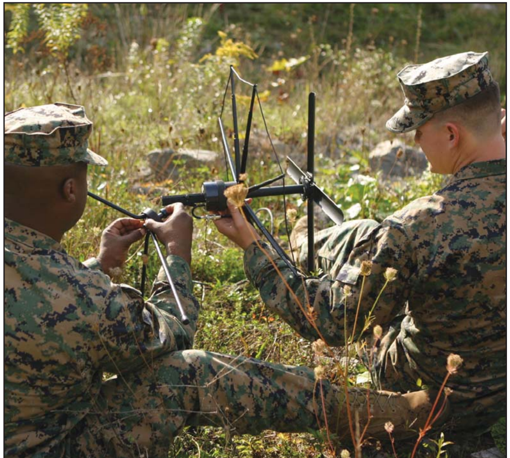
MARSOC Marines from the Foreign Military Training Unit set up their satellite system.

USSOCOM's net-centric approach will tie SOF networks together into a single, cohesive electronic operational environment, providing the necessary capabilities and information to SOF forces whether in garrison or deployed. USSOCOM will provide SOFNet capability to SOF operational forces in a spiral process that will bring enhanced capabilities online as they are certified operational.