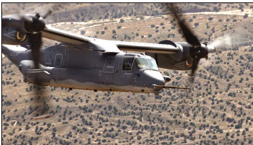
A CV-22 Osprey flies a mission over New Mexico.

Increasing the inventory and capabilities of USSOCOM specialized rotary wing aircraft remains a priority and modernization plans for these aircraft will maintain the Command's ability to project SOF capabilities worldwide in the GWOT. Procurement of additional MH-47G Chinook helicopters combined with the ongoing fleet modernization to the G-model configuration adds critical rotary wing capability and capacity, while streamlining logistics and maintenance.