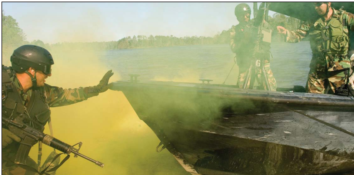
Naval Special Warfare personnel assigned to Naval Small Craft Instruction and Technical Training School train personnel from the Iraqi Riverine Police Force on special boat maneuvers and weapon handling.

graduates from the training pipelines while maintaining quality in the process. The U.S. Army Special Operations Command (USASOC) showed large gains in FY 2006 after increasing instructors and totally redesigning the Special Forces Qualification Course curriculum. A phased plan was implemented to grow from a historic average of 400-450 active duty enlisted graduates per year to 750 for FY 2006. USASOC exceeded this goal, with 762 active duty enlisted Special Forces Soldiers graduating in FY 2006. The Naval Special Warfare Command (NAVSPECWARCOM) is still facing challenges filling SEAL billets, but the Chief of Naval Operations' commitment to SEAL recruitment as a top Navy priority is helping enormously. Additionally, NAVSPECWARCOM introduced several initiatives to their training programs to increase output while maintaining current standards. Air Force Special Operations Command (AFSOC) heavily revised its training pipeline over the last few years, which began to pay significant dividends as evidenced by increasing numbers of newly qualified operators. Based on current production, AFSOC should reach its required manning levels by FY 2009. Our newest component, MARSOC, continues to grow as planned and will be fully manned by FY 2008.