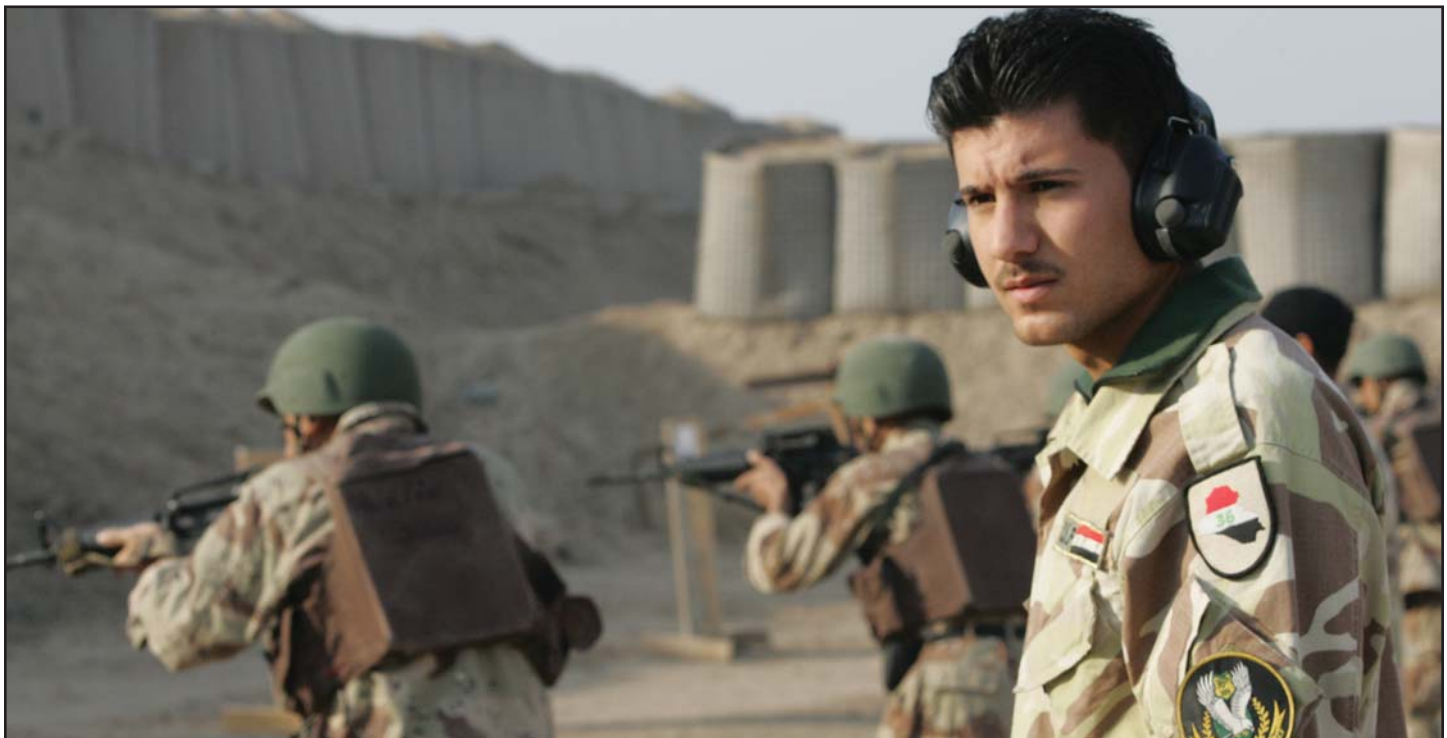
A U.S. SOF-trained Iraqi special operations forces advisor oversees training of his fellow countrymen at a training compound.

In Iraq, U.S. Army Special Forces and U.S. Navy SEALs have significantly expanded Foreign Internal Defense (FID) operations. Training and advising the Iraqi Special Operations Forces is still a main focus of SOF's efforts, but in 2006 several other regular Iraqi army and security forces were included as well. For example, SEALs trained approximately 1500 Iraqi army and police personnel within the past year, executing over 400 combined combat operations. Mentorship of Iraqi units has matured to the point that they have increasingly conducted unilateral operations without the presence of U.S. advisors. SEALs and Special Forces also played a key role in tribal engagement efforts in Al Anbar province, establishing relationships with tribal sheiks that resulted in the recruitment of 300 local tribesmen into the Iraqi police. These successes culminated in 2006, but they did not happen overnight. They are the result of patience and persistence over months and years, demonstrating the generational aspect required of the indirect approach in