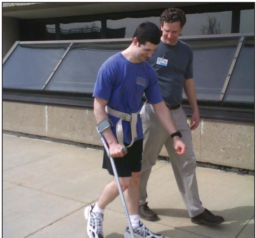
USSOCOM Care Coalition assists wounded SOF Warriors and their families throughout the recovery process and beyond.

USSOCOM's Care Coalition has matured significantly over the past year, helping SOF wounded warriors and their families identify and receive a full spectrum of support by coordinating with DOD, government, and non-government organizations. The Care Coalition is a unique organization that provides support to all casualties, regardless of severity of injury, illness, or wound, and provides this support for life. The Coalition has successfully advocated for SOF casualties and families by providing rapid, personal service of matching their needs with the means of government and non-government organizations. The priority is direct resolution of casualty issues through close relationships with the Office of the Secretary of Defense, the Joint Staff, Service staffs, TRICARE, Veteran's Affairs, numerous government agencies, and always with USSOCOM's Components. Problems that cannot be resolved through government channels are usually resolved by non-government organizations, hundreds of which have the singular mission of supporting military casualties and families. The USSOCOM Care Coalition has developed relationships with many benevolent organizations whose support to SOF