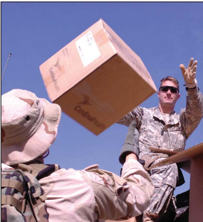
U.S. Army Special Operations medical personnel unload medical supplies during a U.S./Iraqi medical civil-military operation in Ash Sharqat, Iraq.