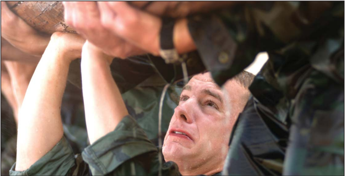
Pararescue trainees carry a heavy training log during the pararescue indoctrination-training course.

wounded warriors includes rental vehicles, airline travel, guide and companion dogs, home improvements, lodging, and legal support.