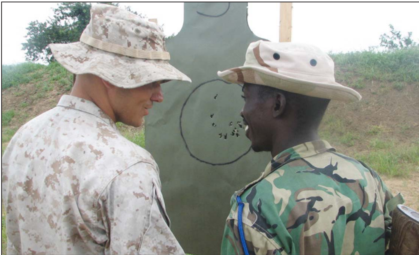
Persistent engagement with our partner nations is key to success in the long war.

supporting the GWOT. Effectively integrating USSOCOM's lessons learned and those of our joint, multinational, interagency, intergovernmental, and Coalition special operations partners is crucial to countering and defeating international terrorism threats. The current Lessons Learned program at USSOCOM is shifting its emphasis from passive collection and archiving lessons observed to a new, more aggressive paradigm. This evolution centers around robust active collection with detailed analysis that is integrated throughout the Command's Strategic Planning Process, the resourcing process, the USSOCOM Long Range Planning Process, and many other processes with resolution of issues and dissemination to SOF and joint communities as the primary goals. The difference in a lesson observed and a lesson learned is the application of corrective action and resourcing to effect change of a process, a piece of equipment, or the manner in which personnel are trained. As lessons learned must be incorporated into the allocation of dollars they must also be considered when developing the operational concepts for future SOF concepts.